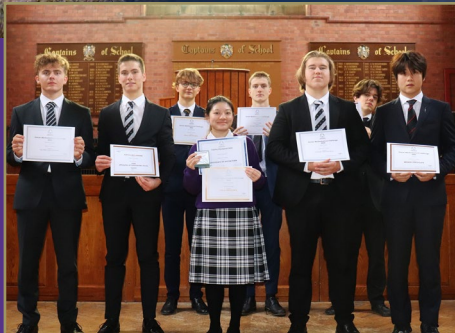
UKMT Maths Challenge Page 14