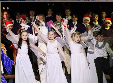
Lower School Nativity Play Page 10