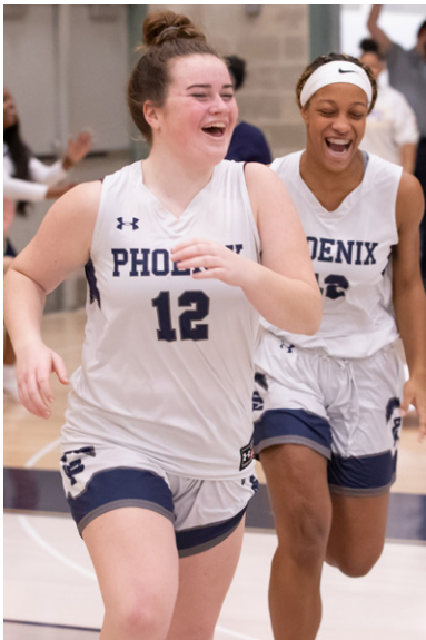
Upper School Spirit Night

Friends' Central's Upper School provides an exceptional college-preparatory program that is challenging, ambitious, and intellectual. Students are held to the highest academic and personal standards in a supportive, collaborative atmosphere that intentionally cultivates the skills and values of lifelong learners whose classroom experiences extend out into the world they will shape.