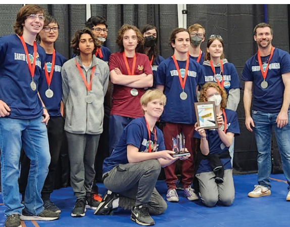
EarthQuakers, Friends' Central's new Robotics Team, placed second and won the Rookie-All-Star award at their first competition in spring 2023.