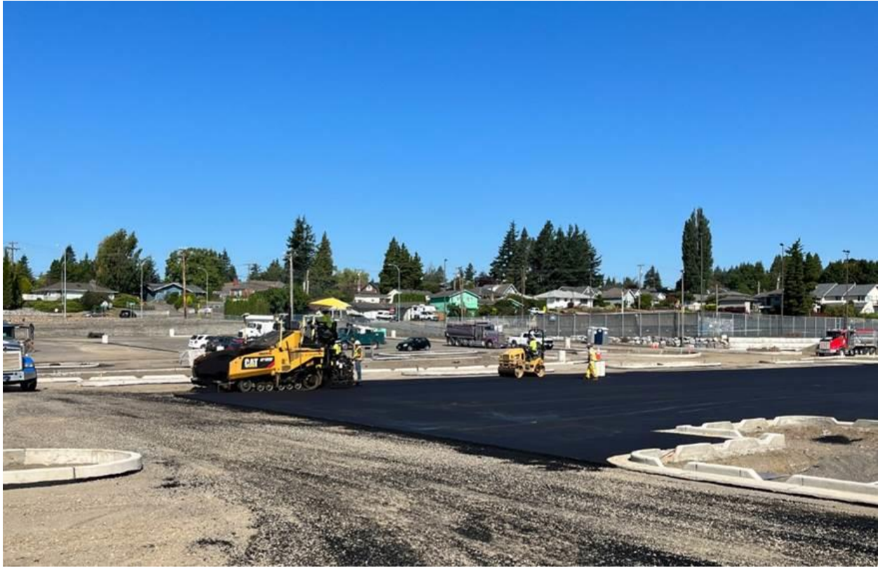
Asphalt being laid in the new student parking lot