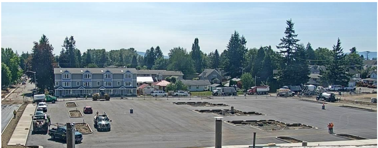
The new student parking lot is almost complete