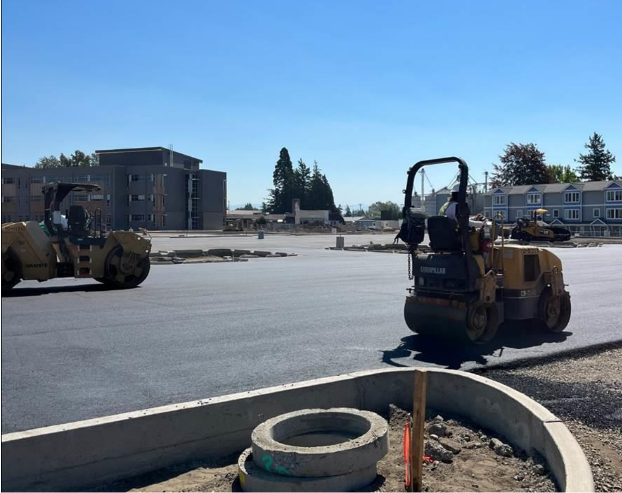
Asphalt being rolled in the new student parking lot