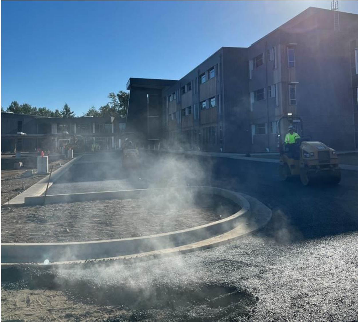
Asphalt being installed around the new parent drop-off area