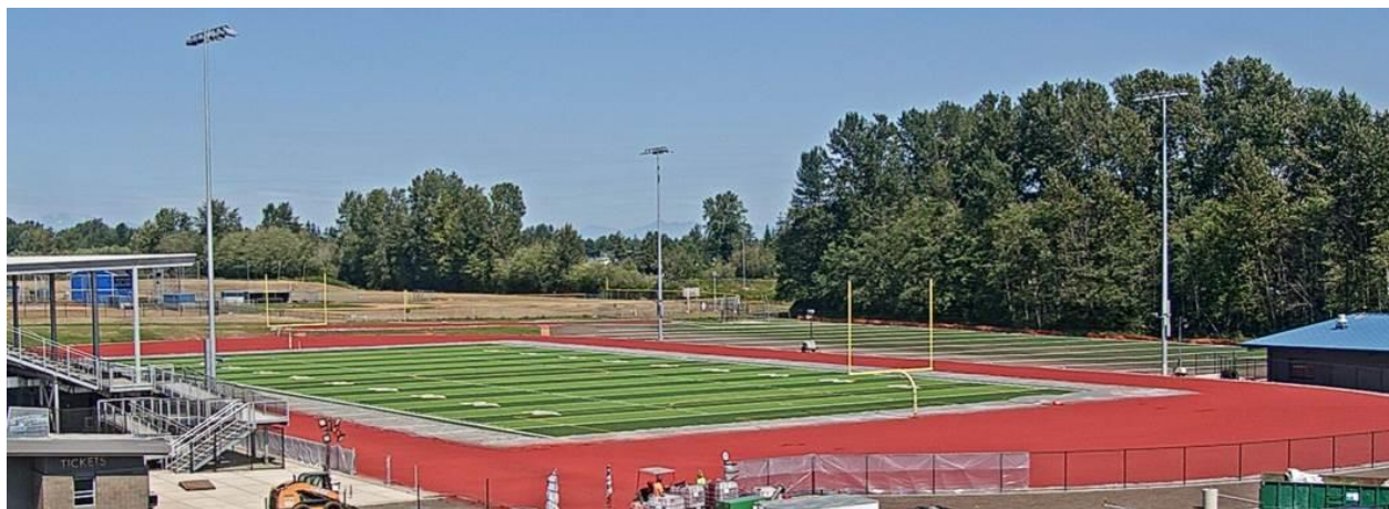
The rubberized track surface is fully installed and ready for final striping