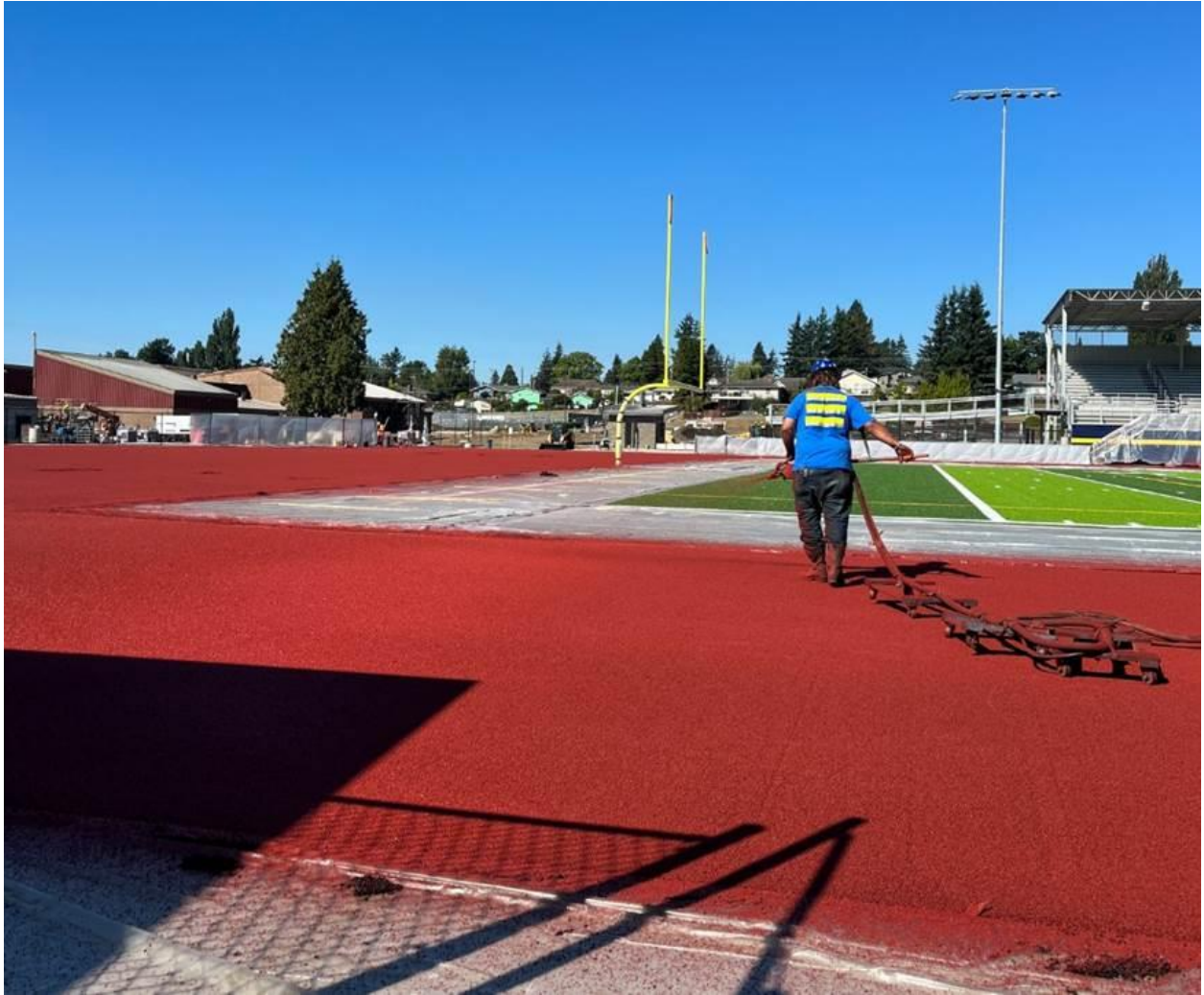
Crews installing rubberized track surface