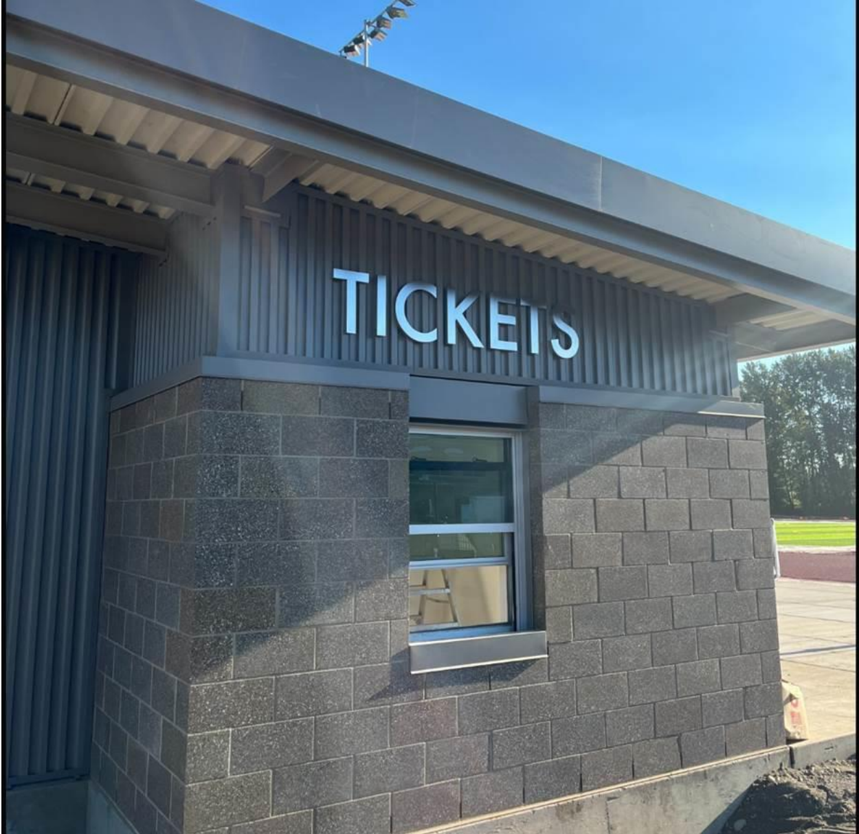
The new ticket booth is almost finished!