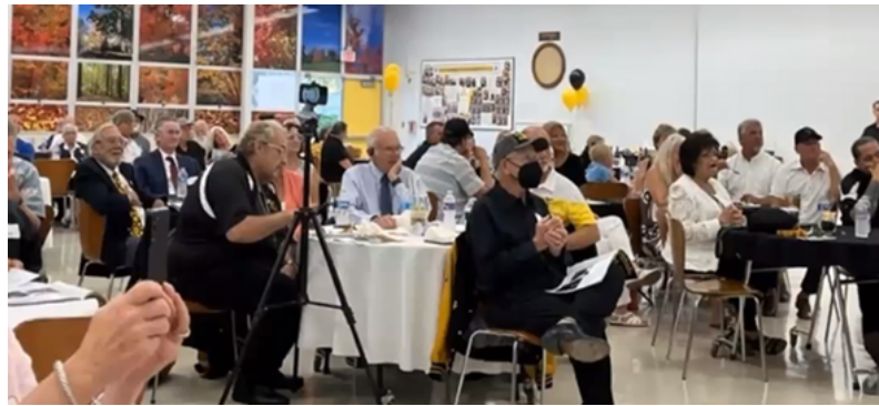
Cabrillo Hall of Fame Celebration

Tuesday, August 22, 2023 Education Center Board Room 5:30 p.m.