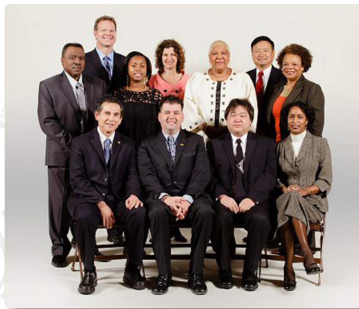
OAKLAND UNIFIED SCHOOL DISTRICT BOARD OF EDUCATION