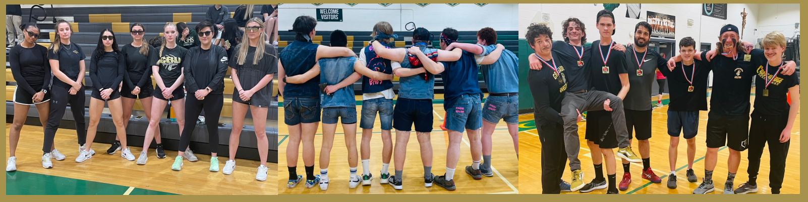
DODGE BALL TOURNAMENT 2023.. WINNING TEAM: BLACK OPS (PICTURED RIGHT ABOVE)