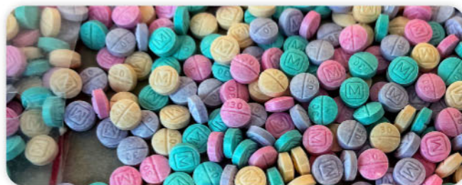
*FAKE rainbow oxycodone M30 tablets containing fentanyl