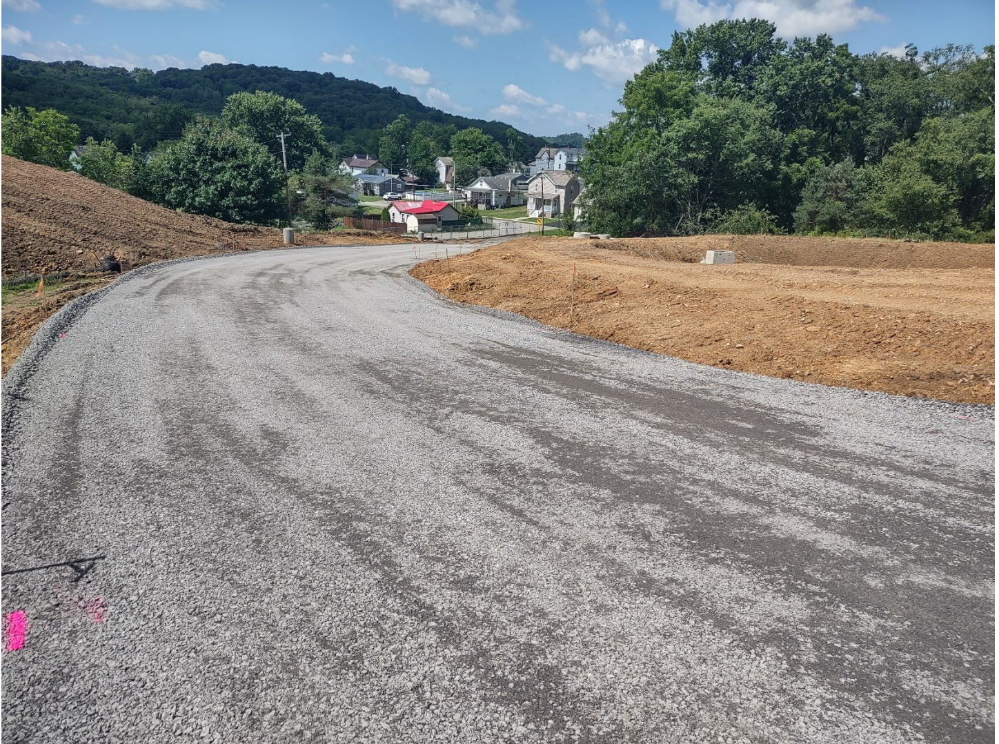
New roadway gravel base to access Spring Street