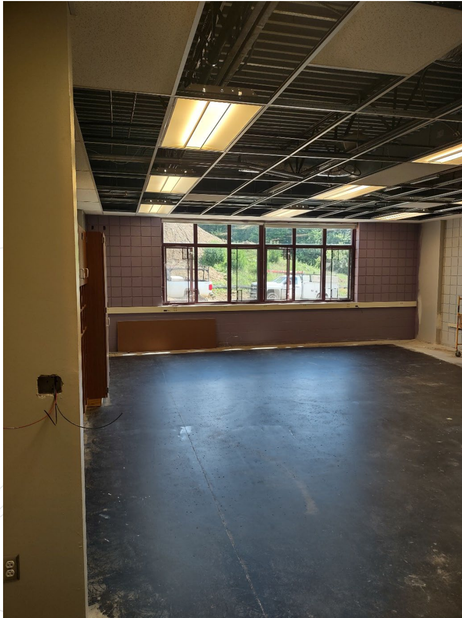
Typical classroom progress. New electric is installed, lights are installed, new ceiling grid is in, walls are patched and painted, and casework is installed.