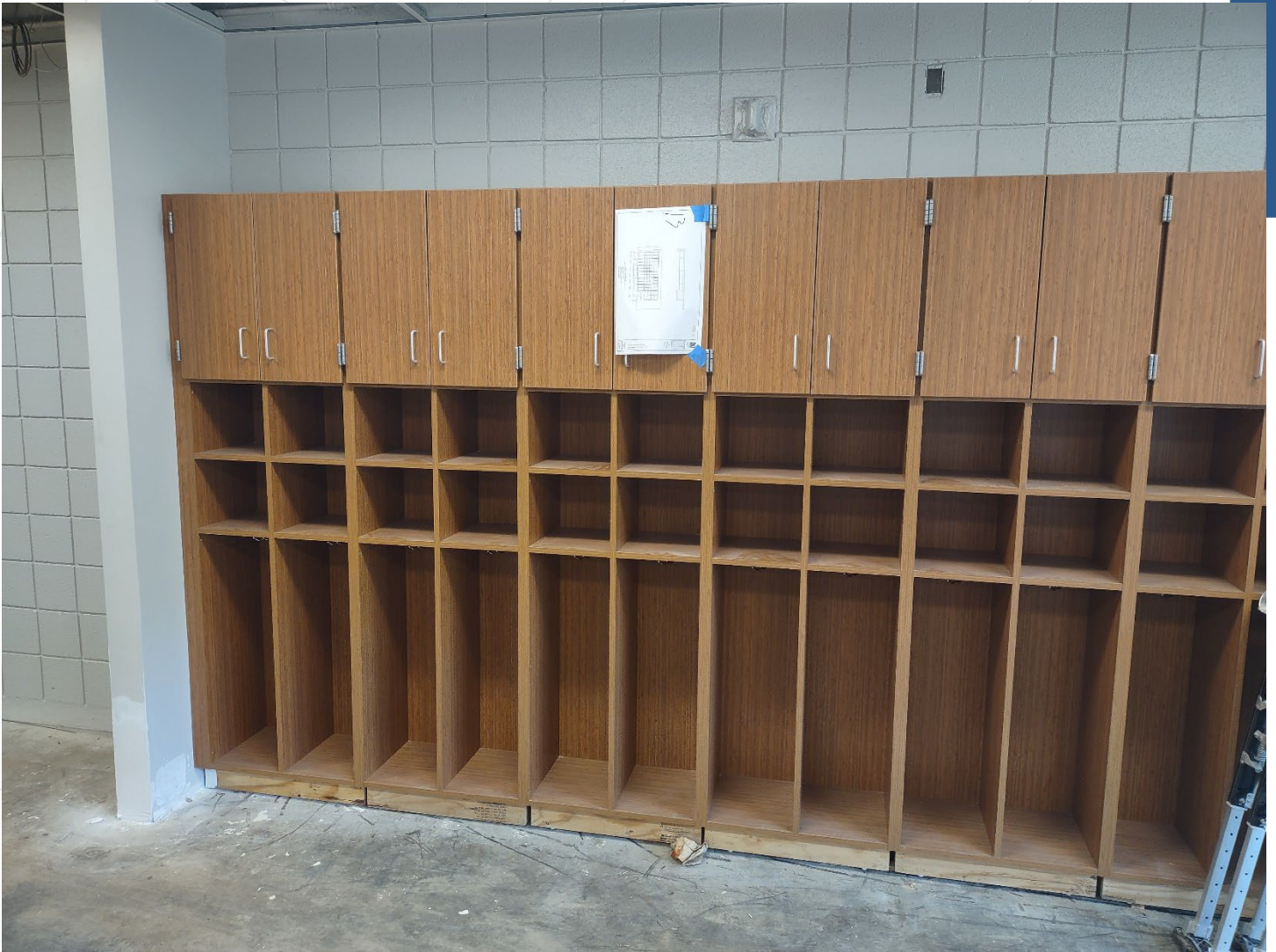
Typical cubbies for classrooms.