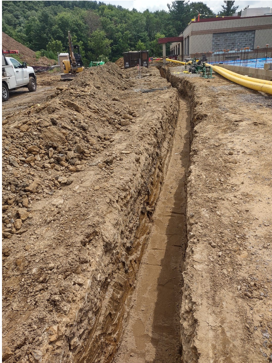
Trench for new gas line to building