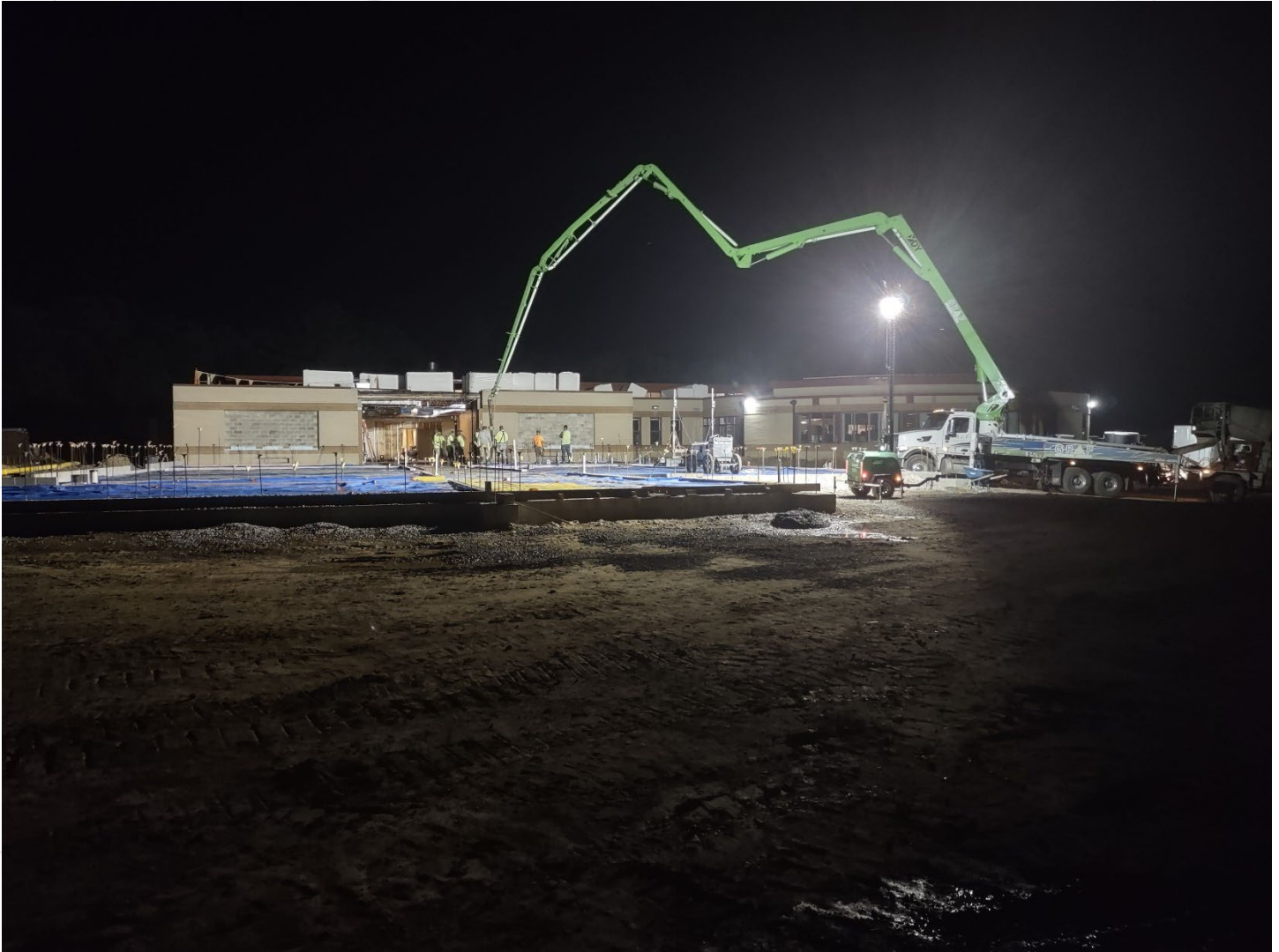
Concrete being pumped for classroom addition floor slab. Pour started at 4:00am to minimize effects of August heat & sun on slab curing.