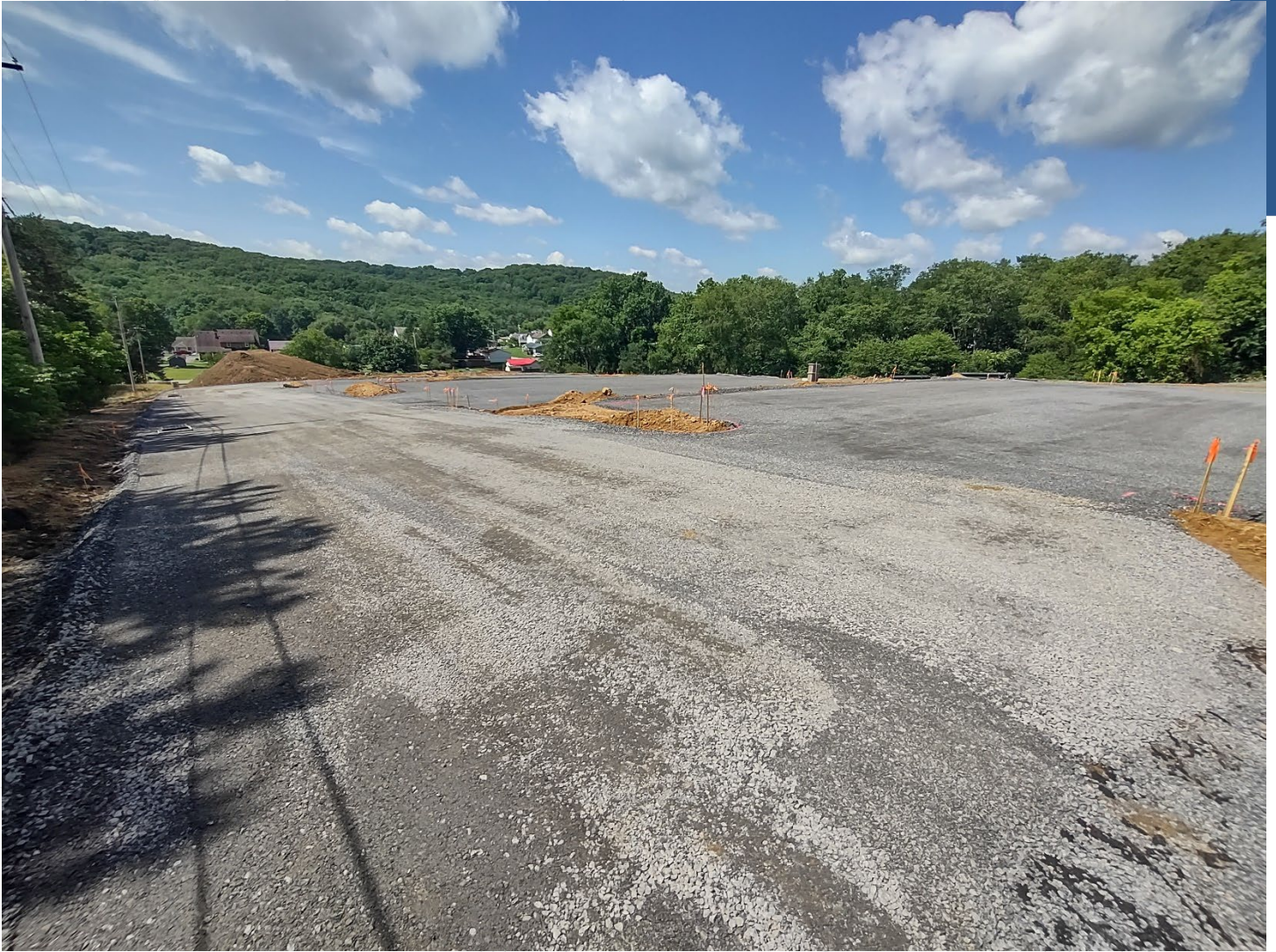
New roadway and parking lots gravel base between Gym and Spring Street