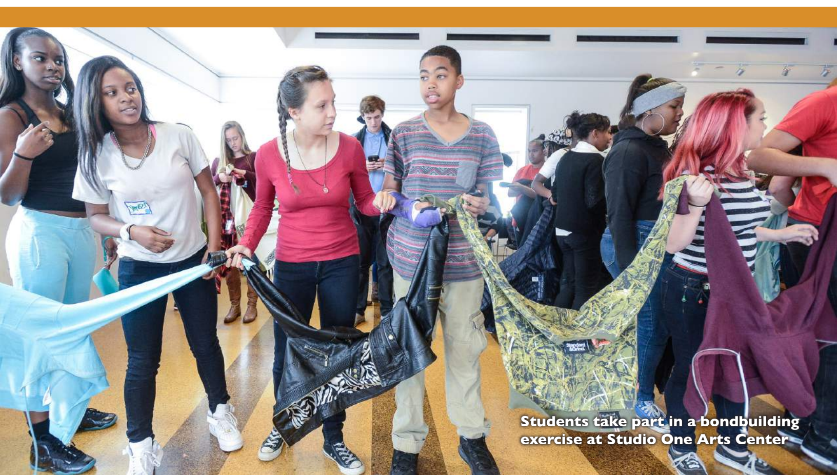
Students take part in a bondbuilding exercise at Studio One Arts Center

The house structure supports deeper relationships — among students, among teachers, and between teachers and students. Those connections are valuable for all students, and are particularly critical for African American males. Deeper connections to their peers and to adults on campus provides the relational glue that supports good attendance, a key factor in students staying on course to graduation, and is critical to shifting away from punitive discipline practices that have