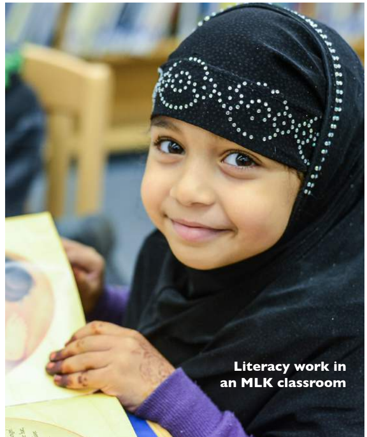
Literacy work in an MLK classroom