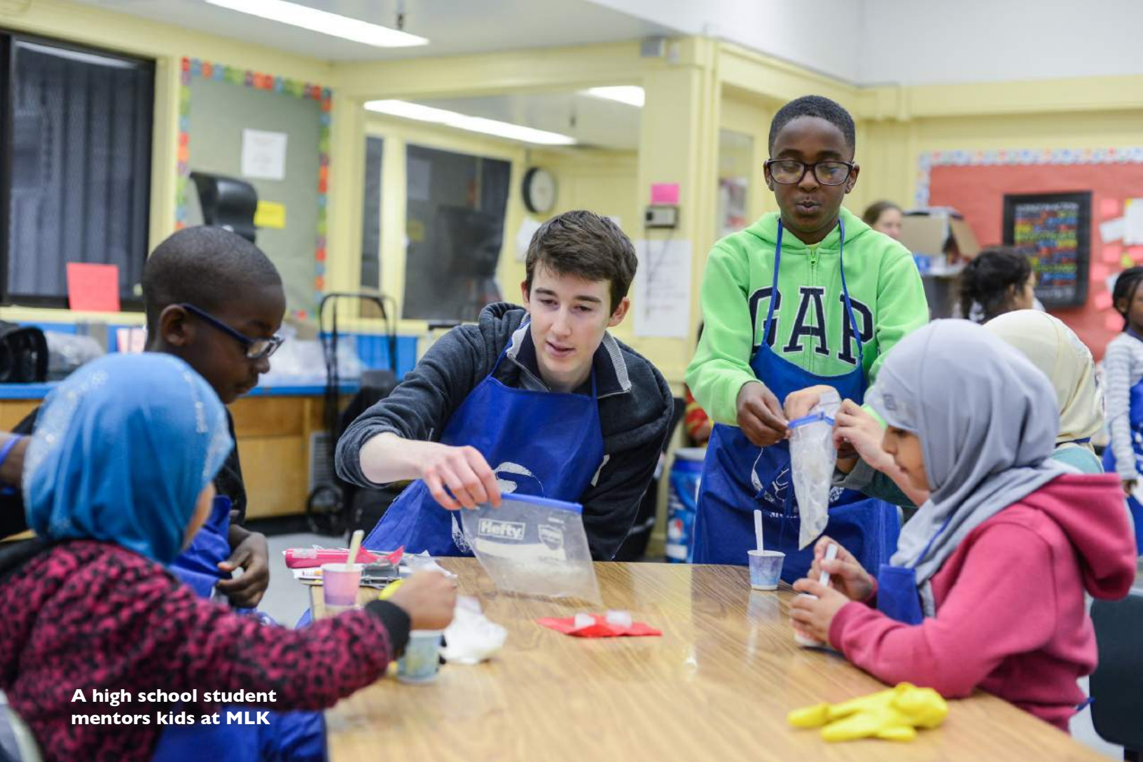
A high school student mentors kids at MLK