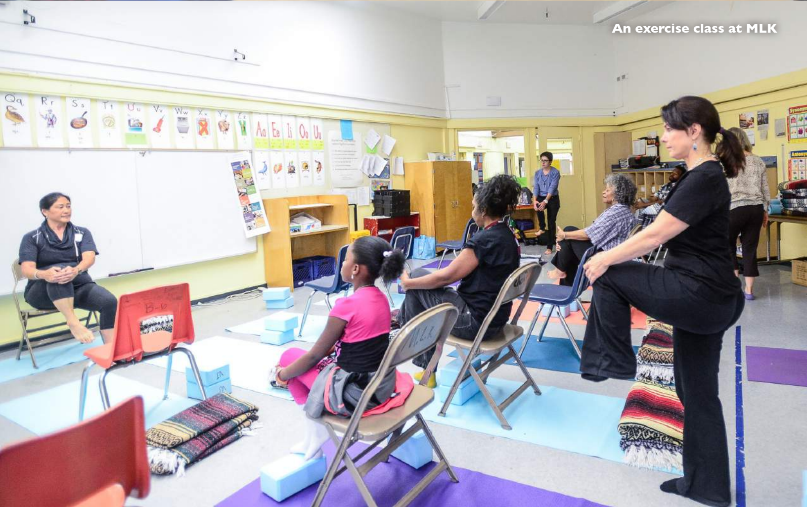
An exercise class at MLK