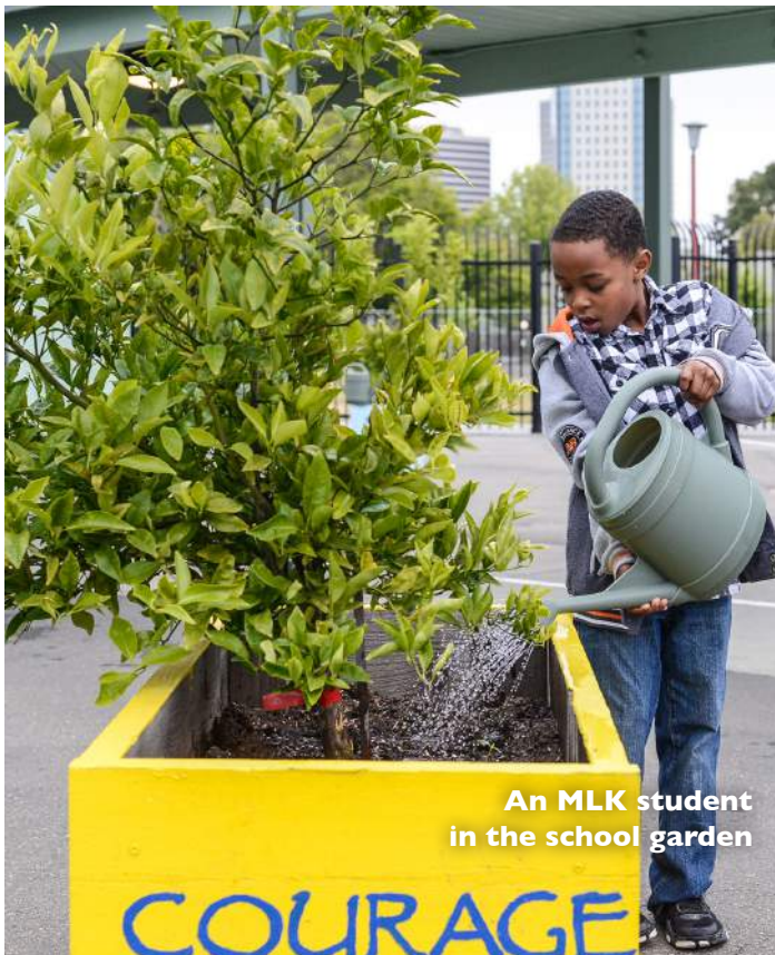
An MLK student in the school garden