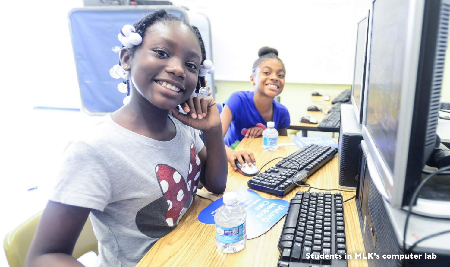
Students in MLK's computer lab