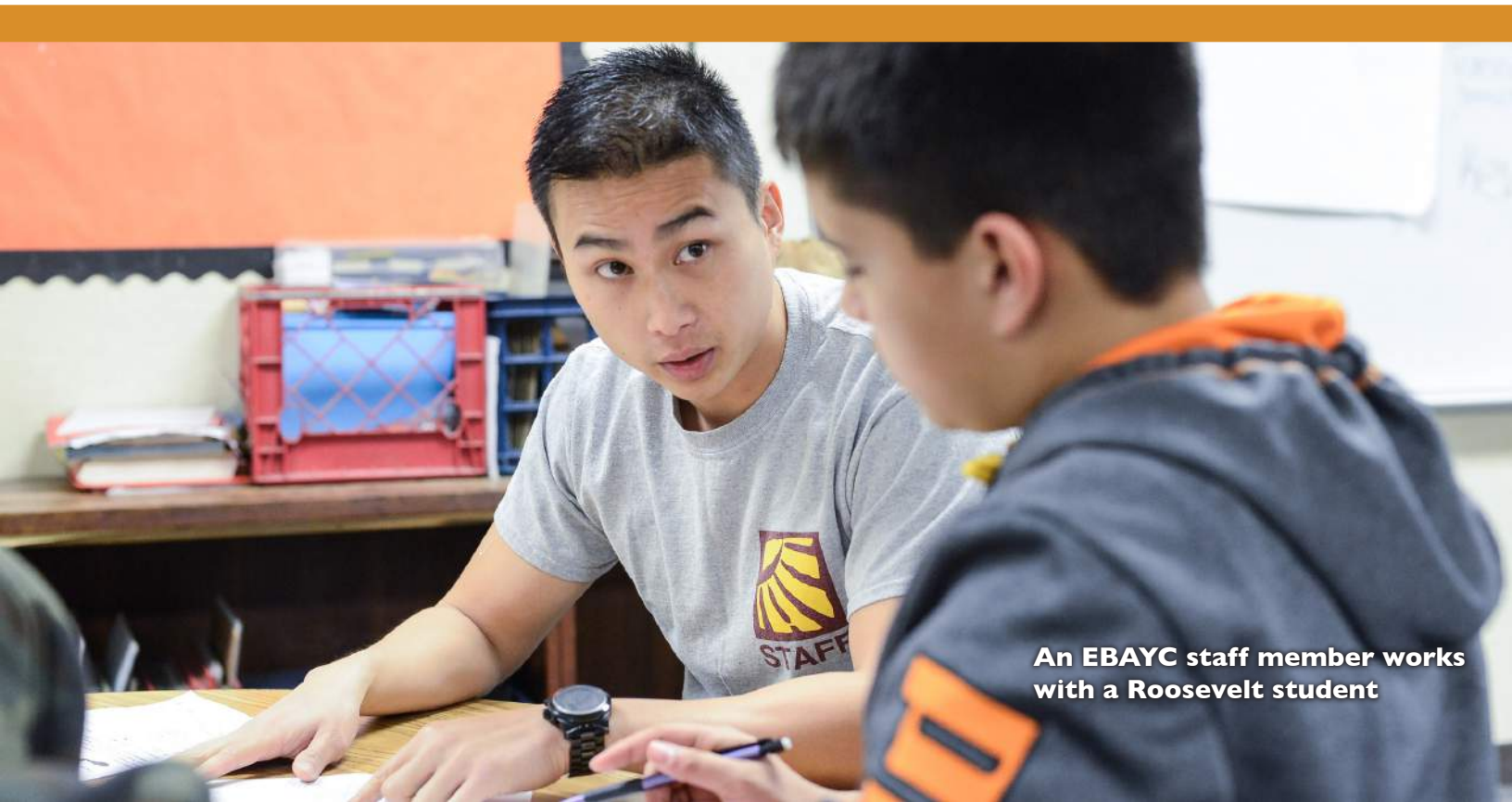
An EBayc staff member works with a Roosevelt student