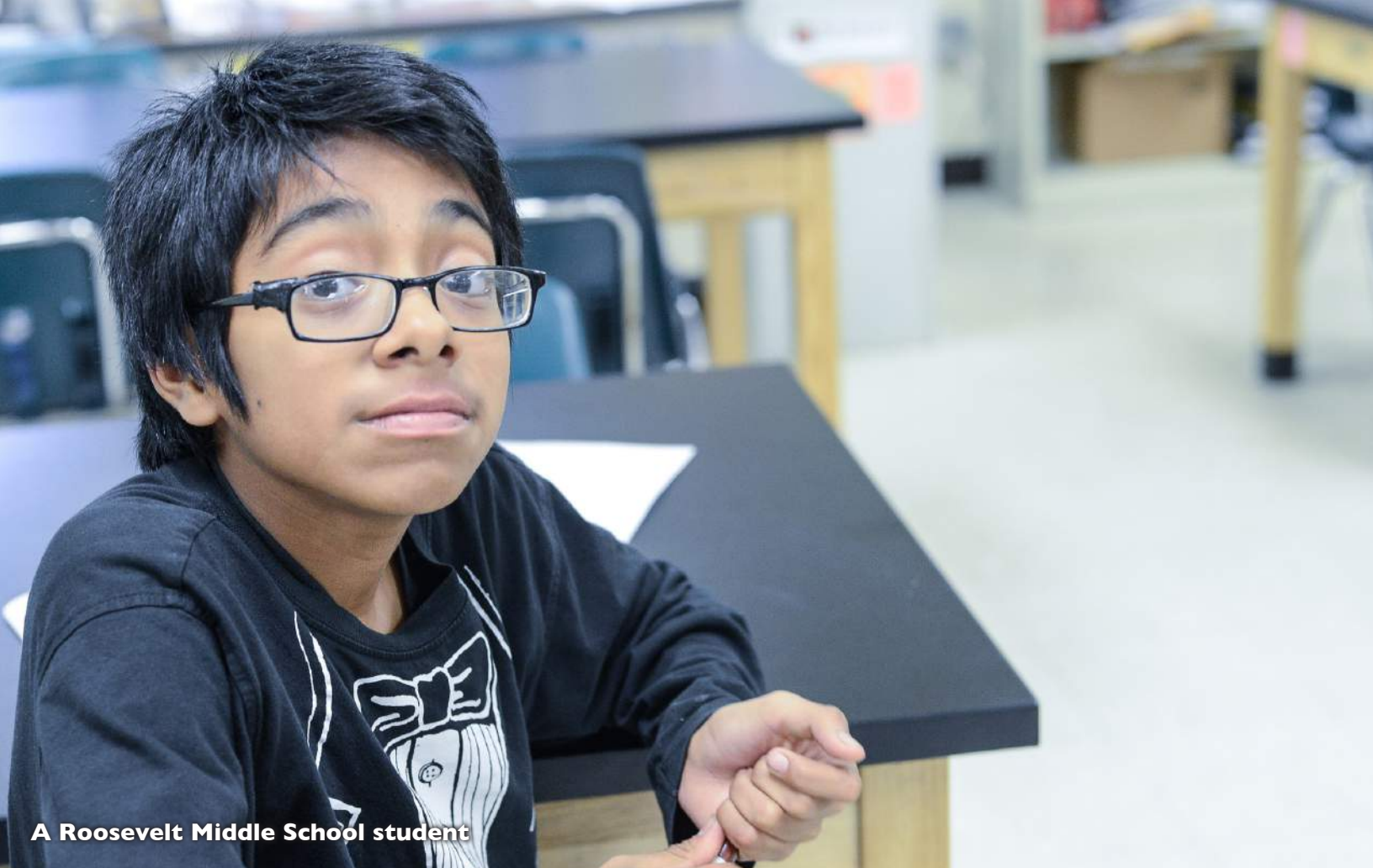
A Roosevelt Middle School student