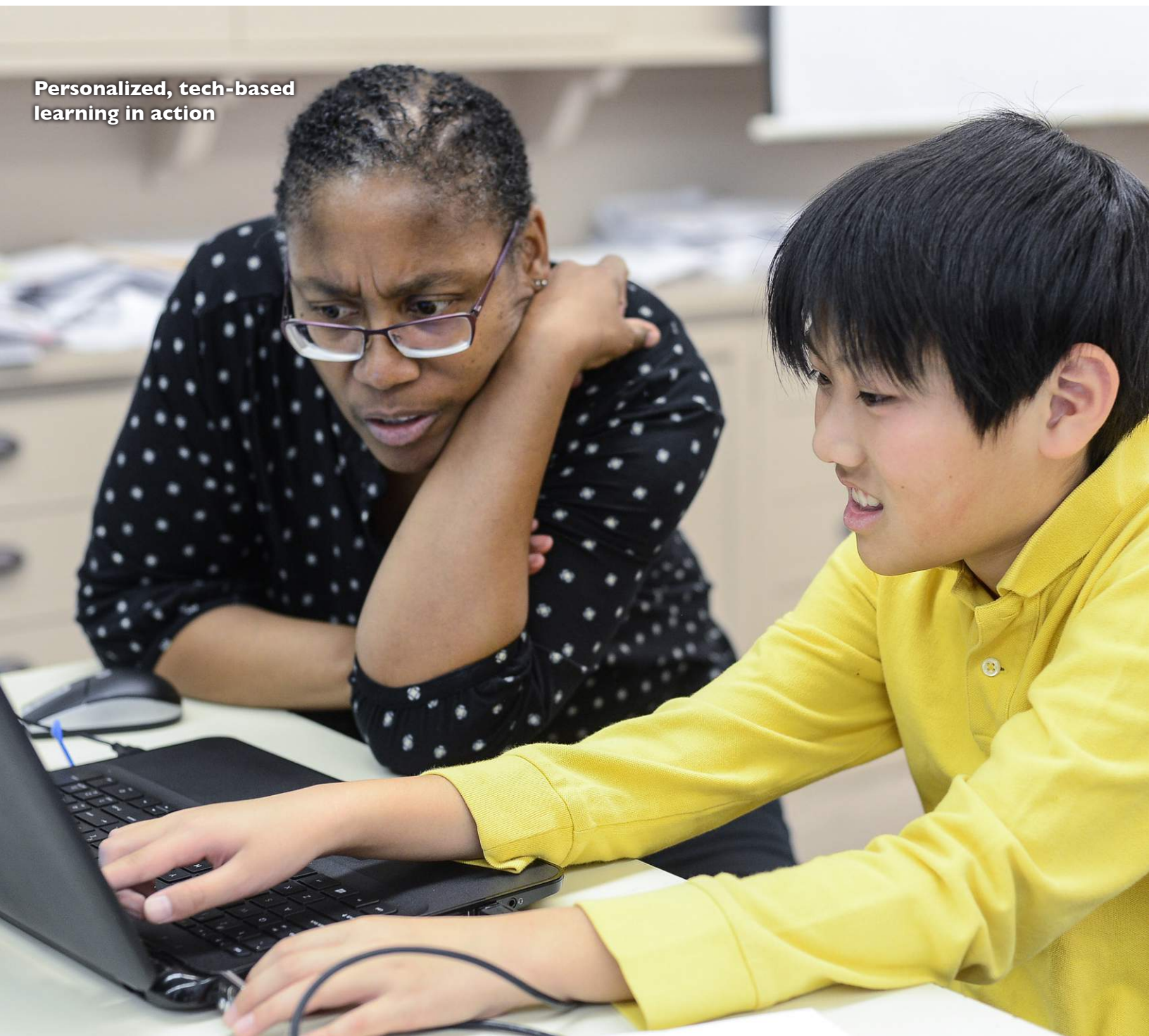
Personalized, tech-based learning in action