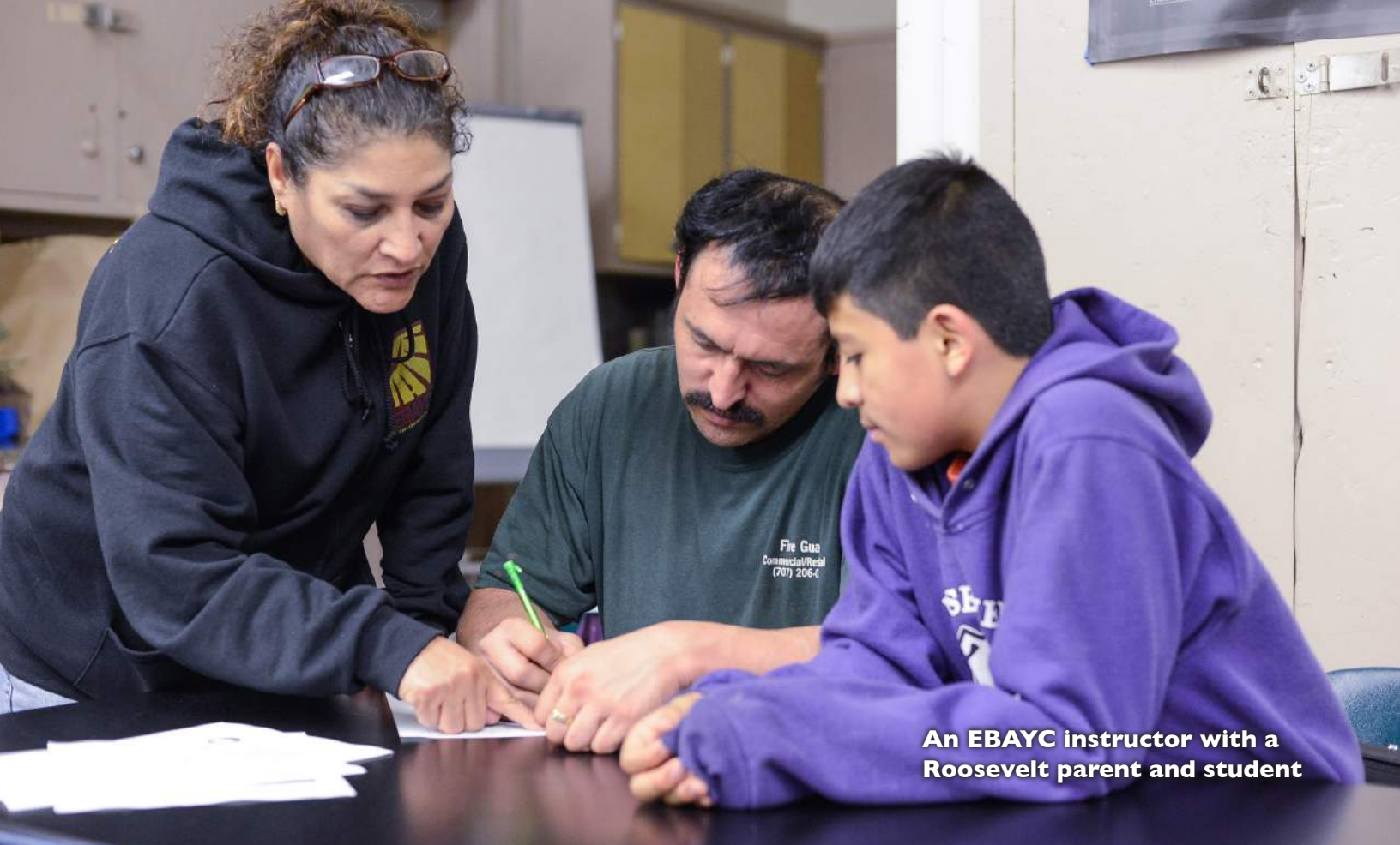
An EBAYC instructor with a Roosevelt parent and student