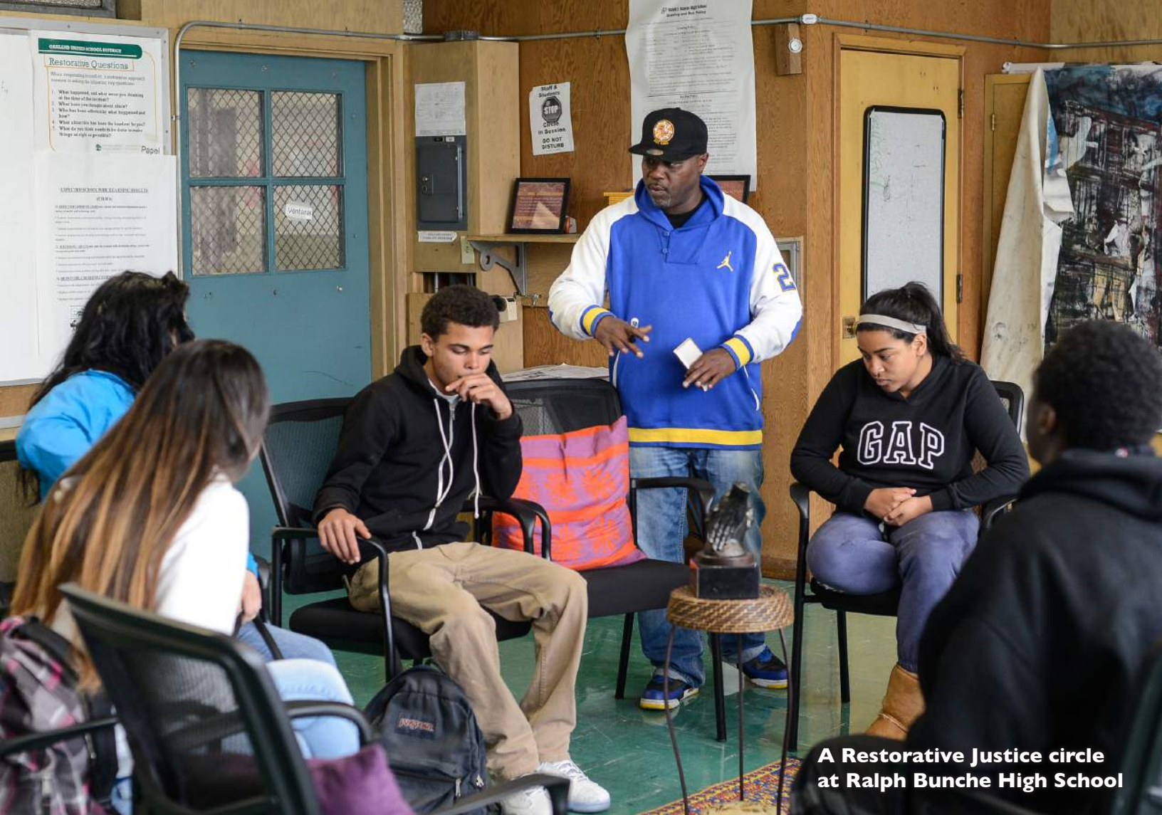
A Restorative Justice circle at Ralph Bunche High School