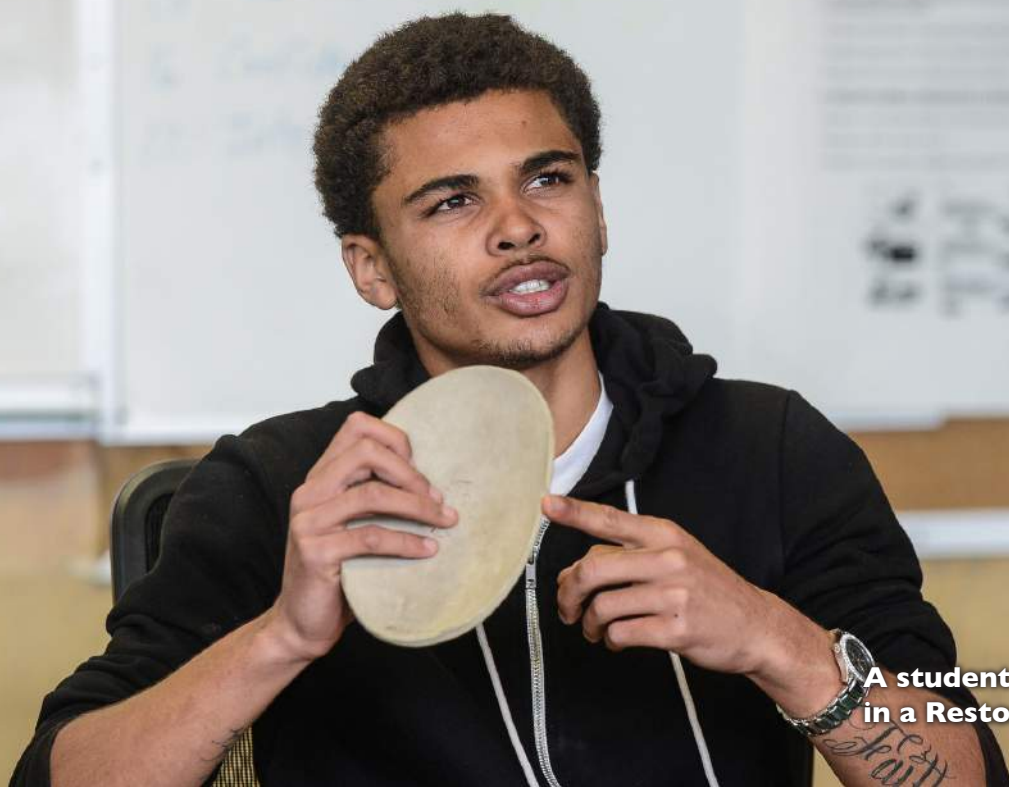
A student holds the talking piece in a Restorative Justice circle