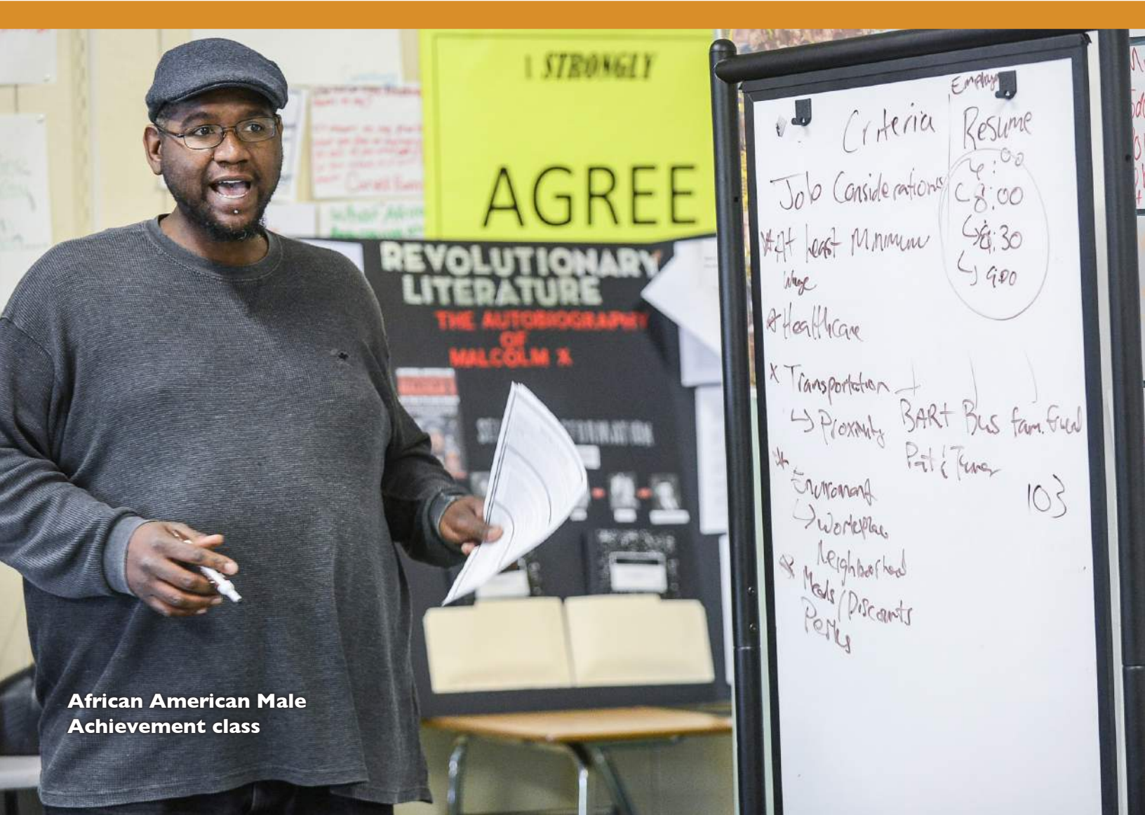
African American Male Achievement class