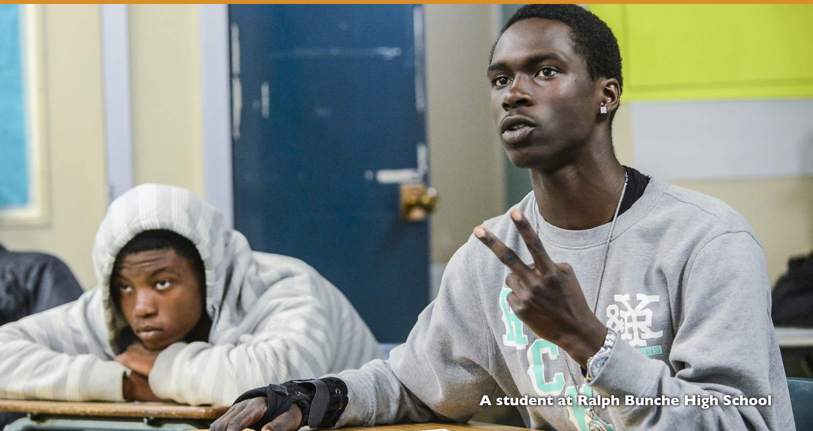
A student at Ralph Bunche High School

Another critical component of preparing students for graduation and for life is developing students' reading ability. Many students arrive at Ralph Bunche with reading levels well below the average for high school students. Through improved diagnostics, one-on-one tutoring, and online tools that can be tailored to student needs, the goal is to accelerate progress. Two staff members — Romany Corella, a teacher on special assignment, and Alice Swafford — work with students and support other teachers to provide personalized support for struggling readers across subject areas. Besides the focused work to improve students' reading levels, Corella is focused on instilling a love for reading among students, and a culture of reading for pleasure among both students and staff at Ralph Bunche. The school has adopted a 22-minute silent reading period one day a week, and students are encouraged to explore both fiction and non-fiction and discuss what they're reading and learning with their classmates.