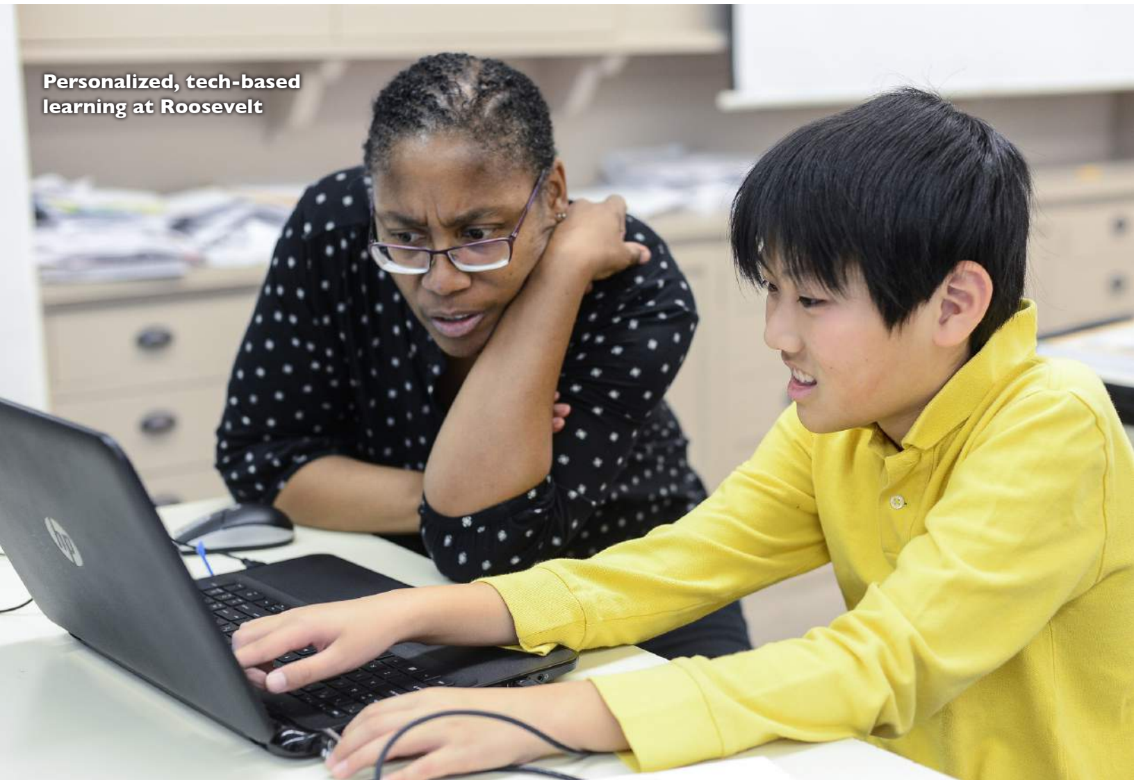
Personalized, tech-based learning at Roosevelt

Community schools stories in which we see these themes highlighted include Coliseum College Prep Academy and Martin Luther King, Jr.