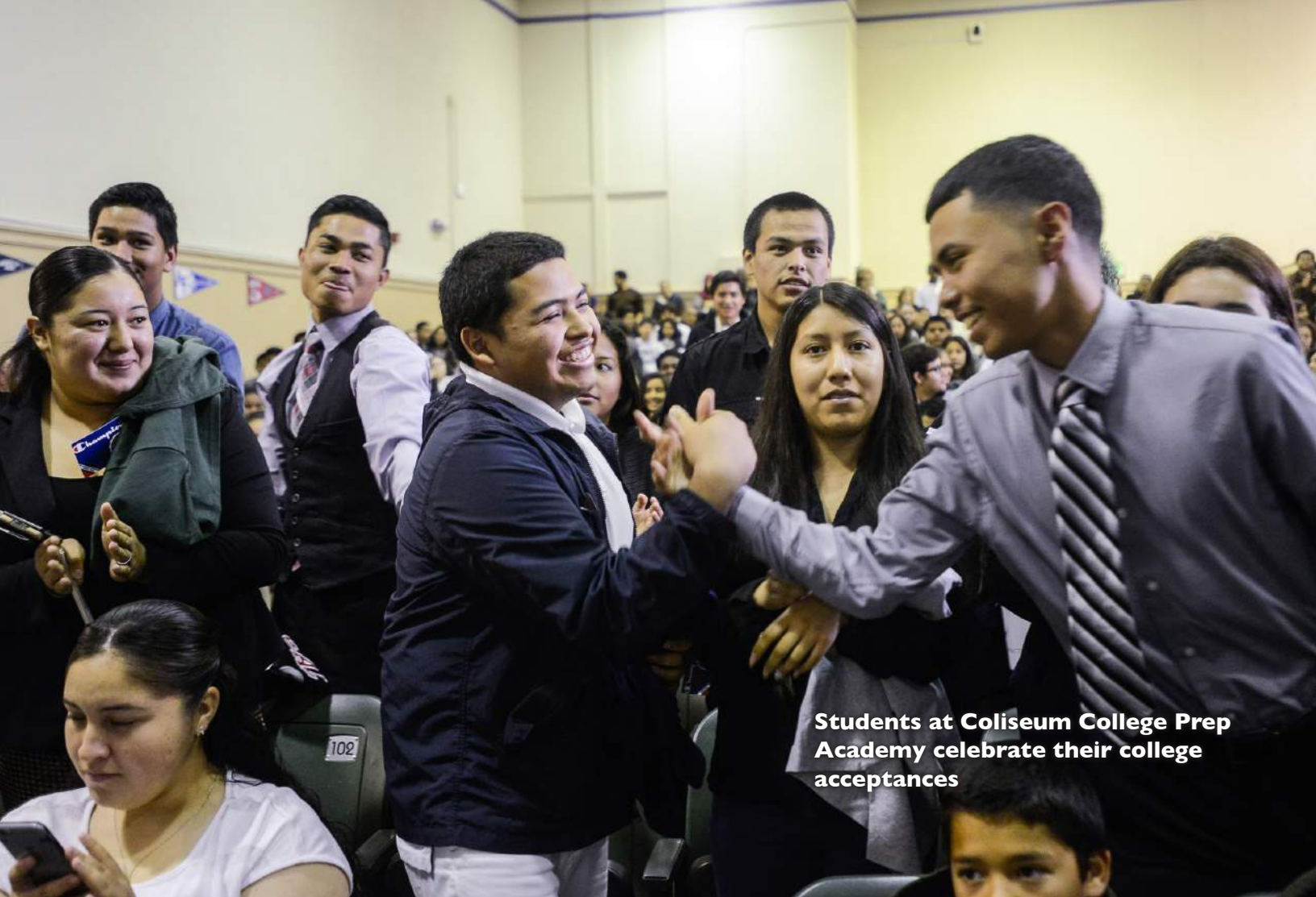
Students at Coliseum College Prep Academy celebrate their college acceptances