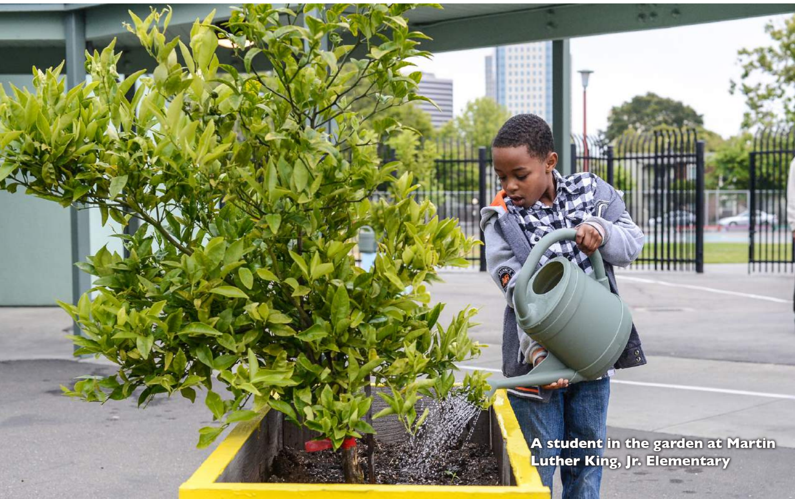
A student in the garden at Martin Luther King, Jr. Elementary

Community schools stories in which we see these themes highlighted include Ralph J. Bunche High School and Oakland Technical High School.