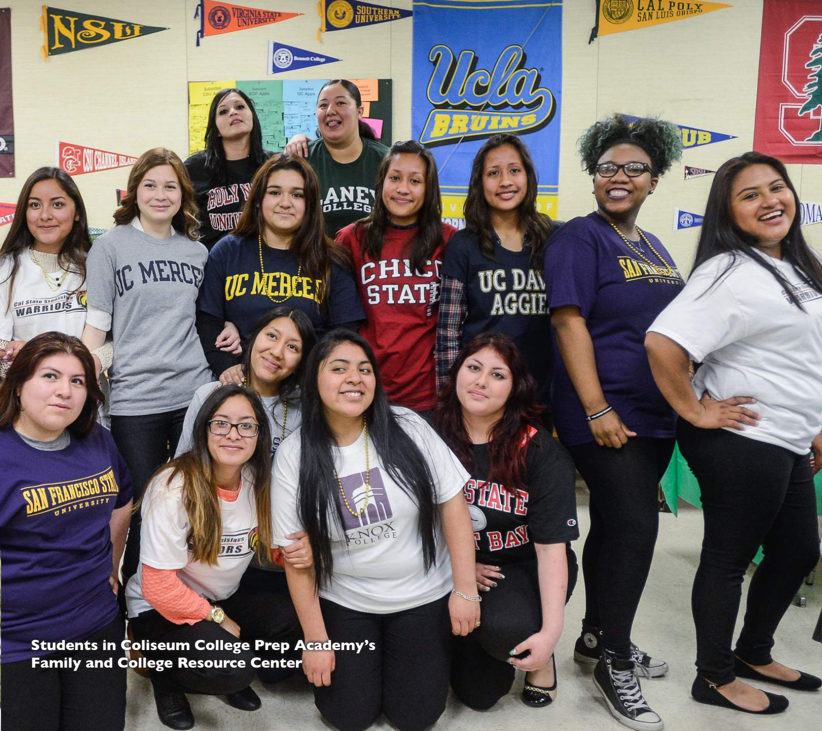
Students in Coliseum College Prep Academy's Family and College Resource Center