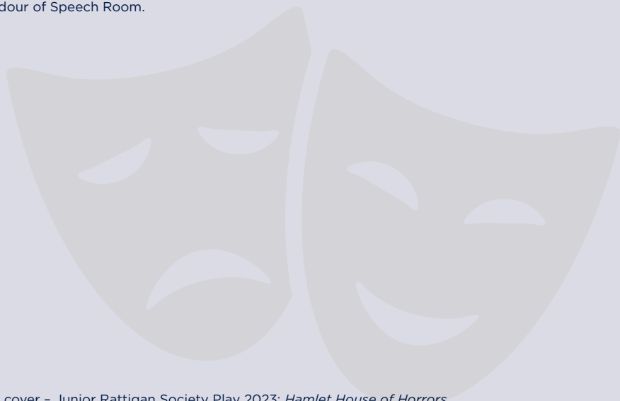
Front cover – Junior Rattigan Society Play 2023: Hamlet House of Horrors

Tickets are required for all performances. For information on availability or to tell us about any accessibility requirements, contact theatre@harrowsschool.org.uk or call 020 8872 8344.