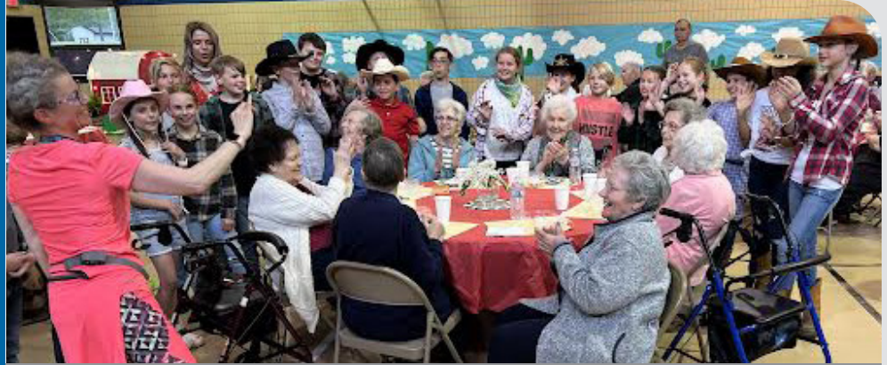
JMES Student Council entertain senior citizens.