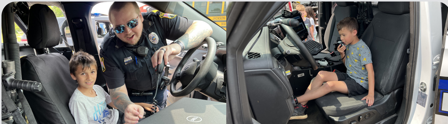
Elementary Safety Day!