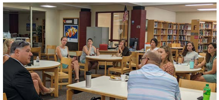
The New Teacher Academy provided two days of training with administrators and mentors for new staff members to help them acclimate and prepare for the opening of school.