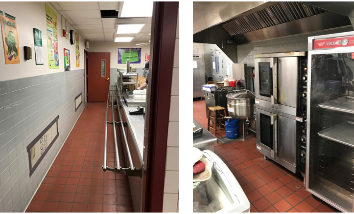
ELEMENTARY CAFETERIA — Kitchen updates and renovations to 1955 construction. Replacement of inefficient appliances with energy saving models. Improvement of work space and traffic flow.