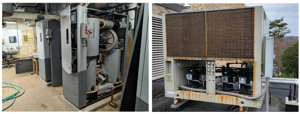
Including HVAC, Plumbing, Electrical and Technology Systems.