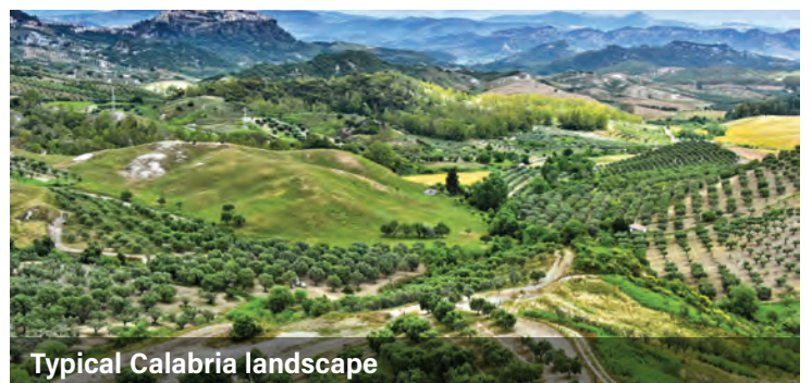
Typical Calabria landscape