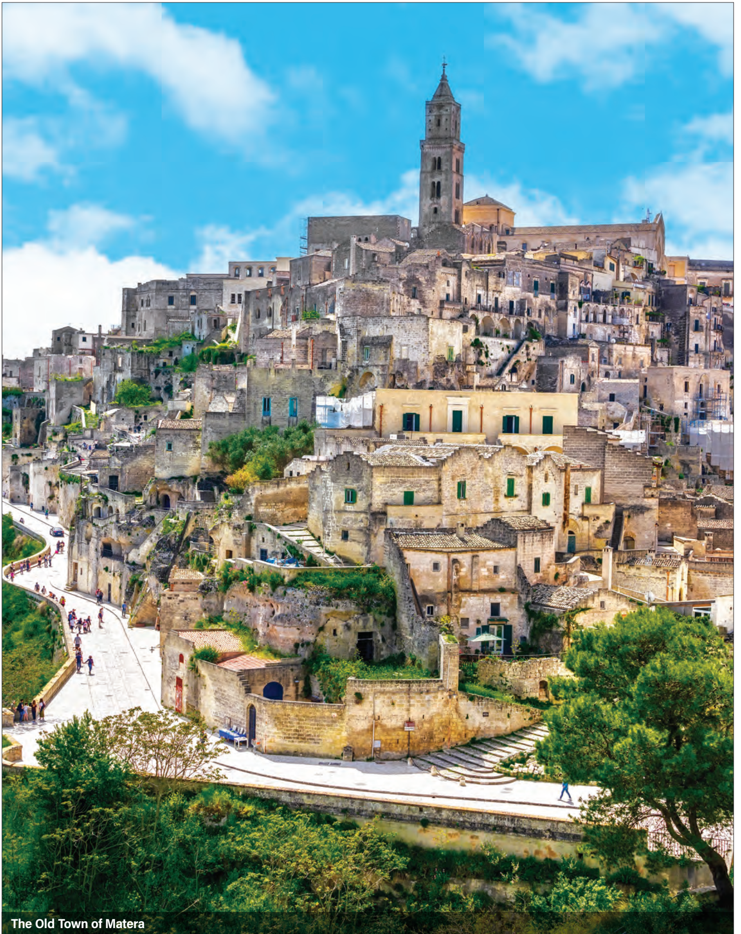
The Old Town of Matera

FOR RESERVATIONS AND INFORMATION, PLEASE CALL THALASSA JOURNEYS TOLL-FREE AT 866-633-3611