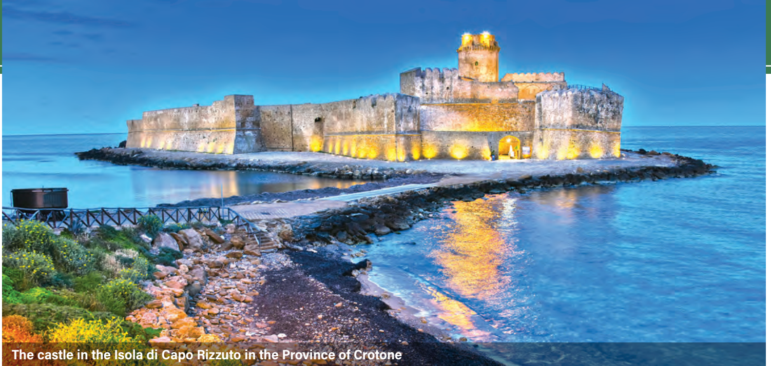
The castle in the Isola di Capo Rizzuto in the Province of Crotona

government, and continued to prosper until the Roman period. The extensive remains of the city include temples, a theater, other public buildings and city walls. The museum displays a collection of artifacts. Following lunch, drive along the southernmost part of mainland Italy to Reggio di Calabria, stopping en route for a stroll in Scilla, rising on a rocky cliff at the Strait of Messina. Check in at the Grand Hotel Excelsior for two nights. (B, L)