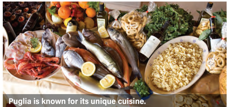
Puglia is known for its unique cuisine.