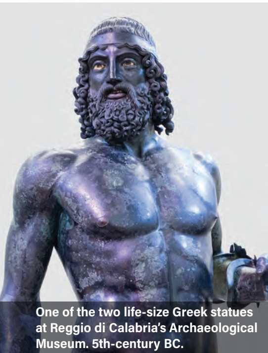
One of the two life-size Greek statues at Reggio di Calabria's Archaeological Museum. 5th-century BC.

NOT INCLUDED: International airfare; travel insurance; expenses of a personal nature; any items not mentioned in the itinerary or the above inclusions.