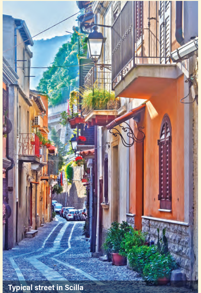
Typical street in Scilla

and Music of Antonia Padoani Bembo (2006; 2013); a set of essays, Fiori Musicali: Liber Amicorum Alexander Silbiger (2010), and another monograph, The Vision of Music of Saint Hildegard’s Scivias—Synthesizing Image, Text, Notation, and Theory (2013). Early in her career, she was an award-winning semi-professional baroque flutist; currently, she plays the renaissance alto flute with the Wellesley College Collegium Musicum. She is an avid Europhile who has lived and worked in France, the Netherlands, and Italy.