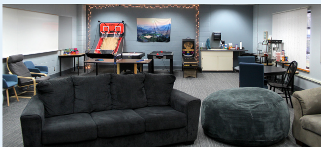
The new teen meeting room at the Hockinson Community Center opened this fall.

Hockinson School District endeavors to improve strategies and programs to meet community needs. The Hockinson Community Center is an example of such people-centered thinking. The facility, which was formerly Hockinson Middle School, was repurposed to support families, rebuild a strong sense of community following the pandemic, and invest in a bright future for students and neighbors alike.