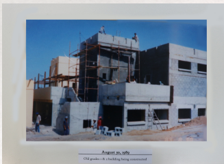
August 20, 1987 Old grades building being constructed