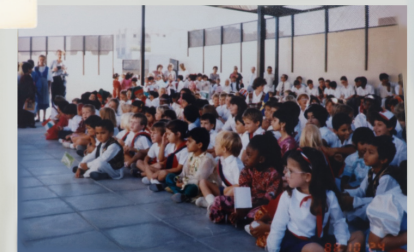
October 24, 1988 Class of 1988 seated in the front row at the first U.S. Day celebrations on campus