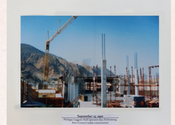
September 26, 1987 The first concrete slab is poured into the ground floor