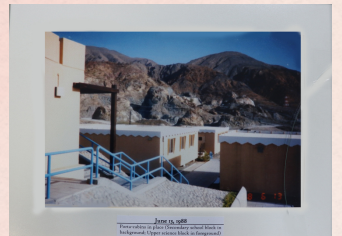
June 15, 1988 Transfer of old grades building to new day classes building