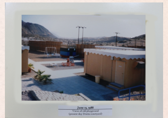
June 15, 1988 Transfer of old grades building to new day classes building