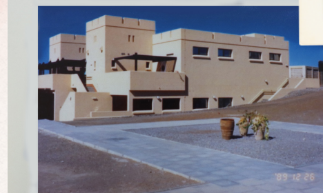
December 26, 1989 Old grades 1 & 2 building completed