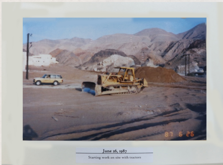
June 26, 1987 Starting work on site with tractor