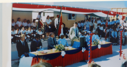
November 11, 1987 Speech by U.S. Ambassador Montgomery at the official opening ceremony