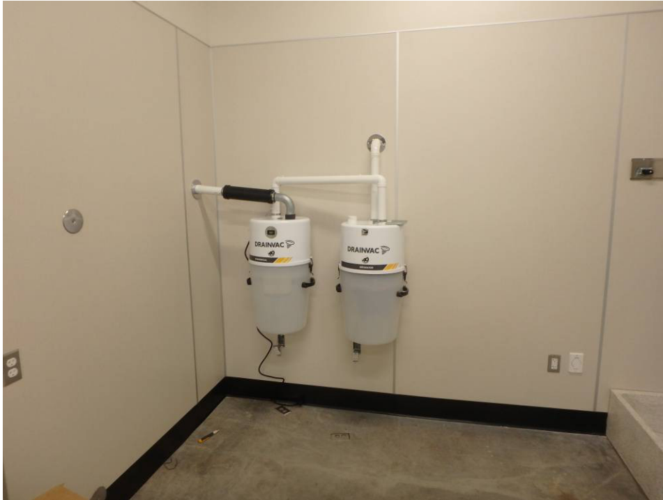
Kennel Room acoustical wall panels, vacuum (replaced) and janitor sink on the north wall