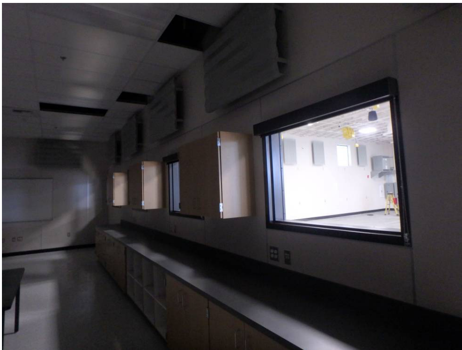
Looking west along the north classroom's north wall