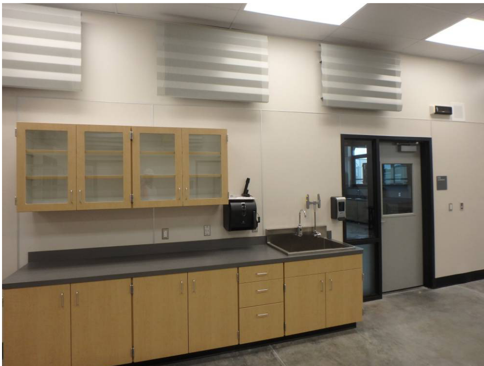
Lab- west casework