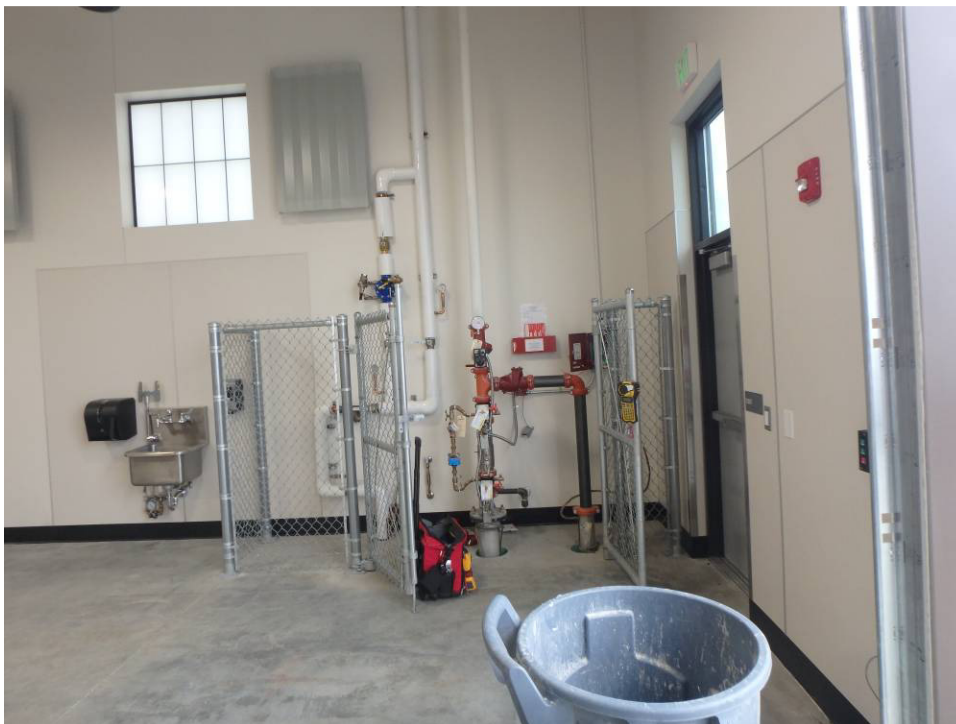
Looking north at the northeast corner of the shop