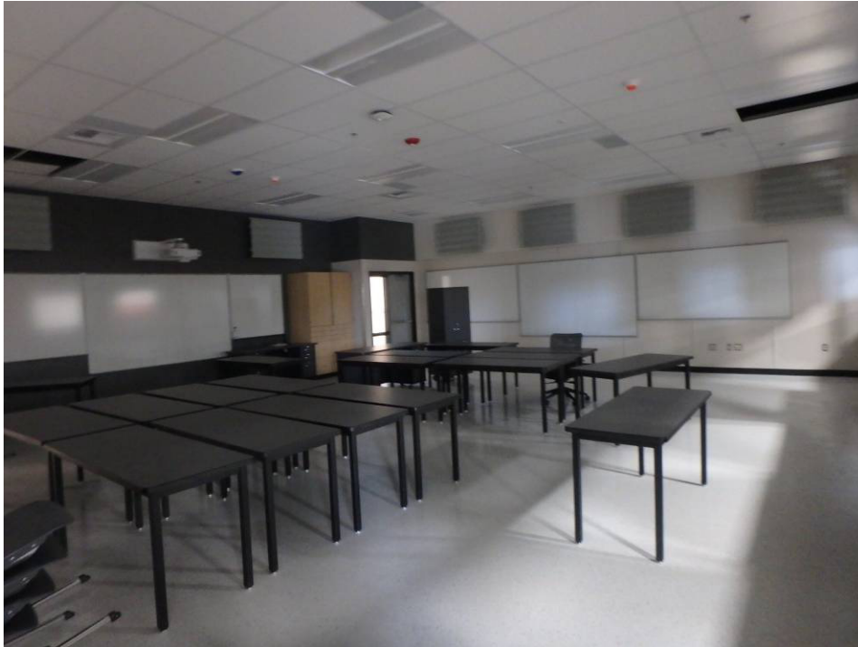
Looking southwest at the southwest corner of the north classroom