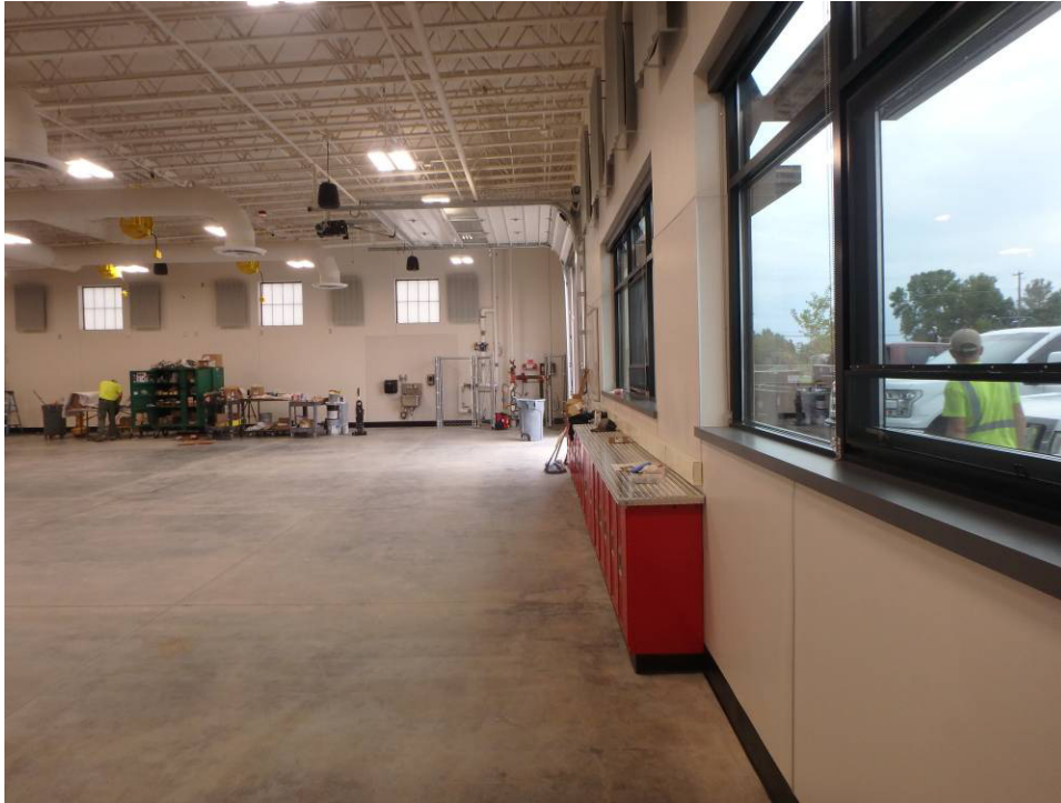
Looking north along the shop's east wall and lockers with diamond plate top