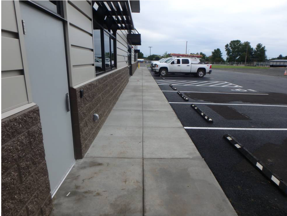
Looking north at the front sidewalk