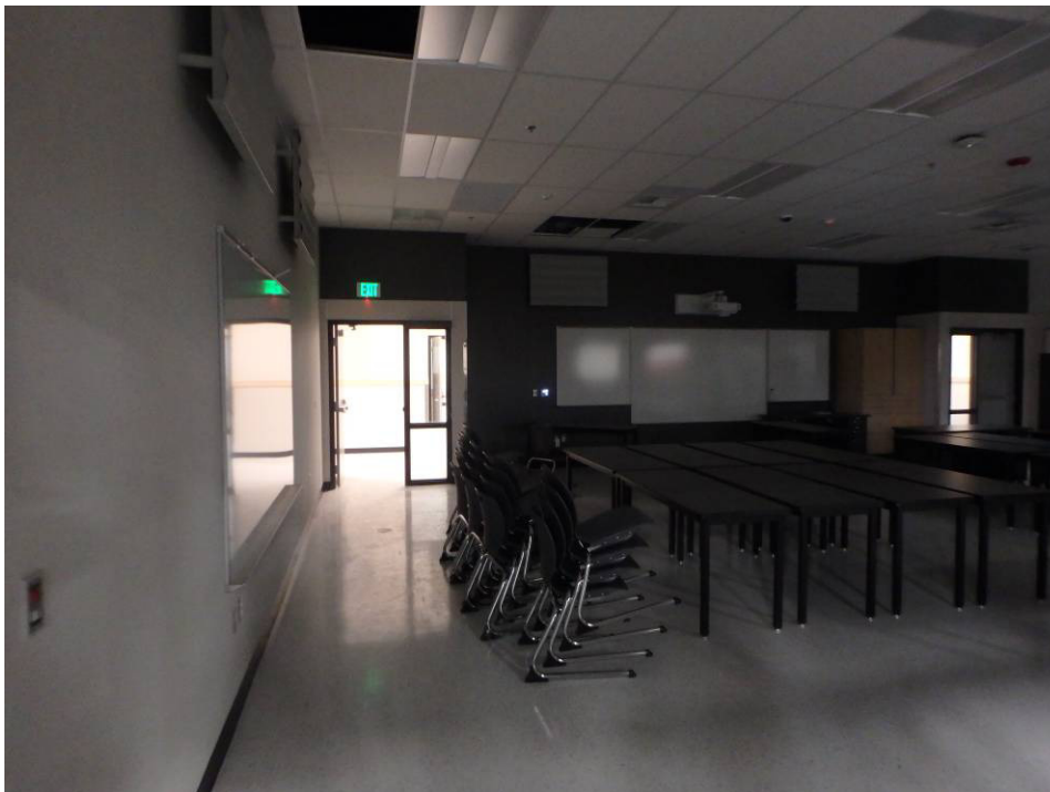
Looking south at the southeast corner of the north classroom