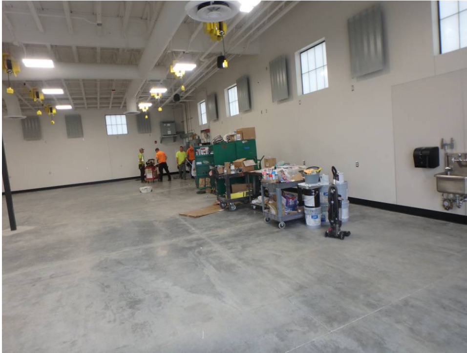
Looking west at the Shop's north wall