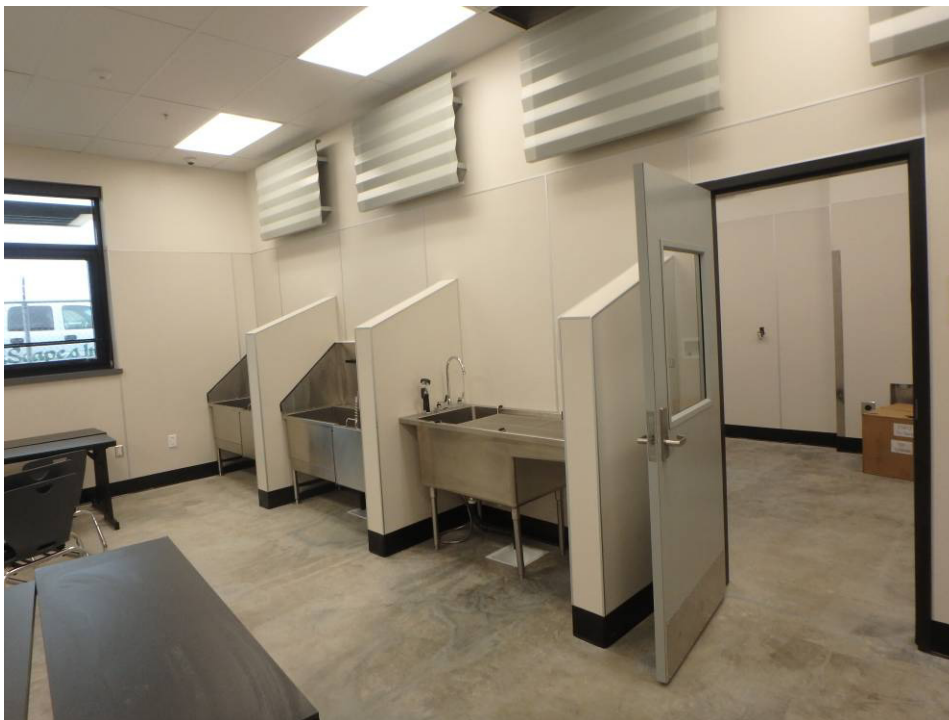
Lab dogwash stations and acoustical panels