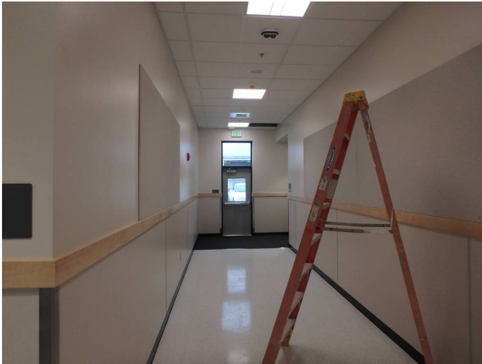
Looking west at the main east-west corridor