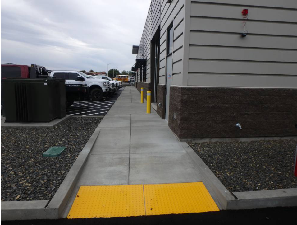
Looking south at the front sidewalk