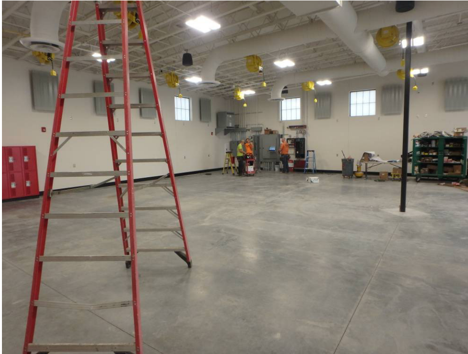
Looking northnorthwest at the electrical panels and transformer mounted on the wall