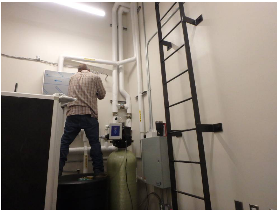
Working on the piping above the water softener