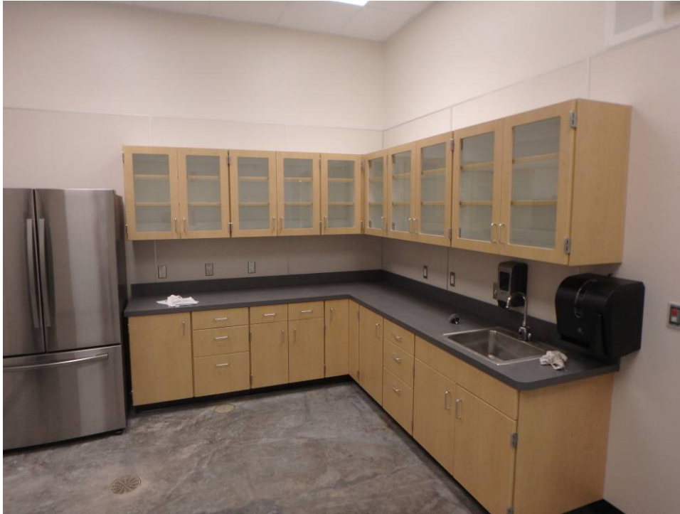
Lab – looking south into the lab from the north lab door