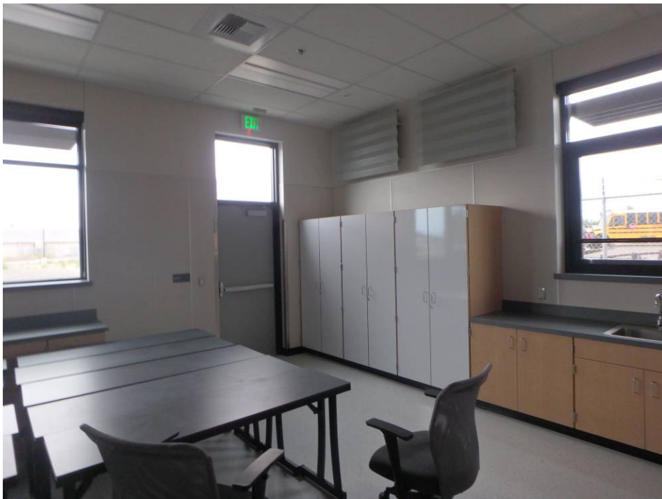
Looking at the south classroom entry