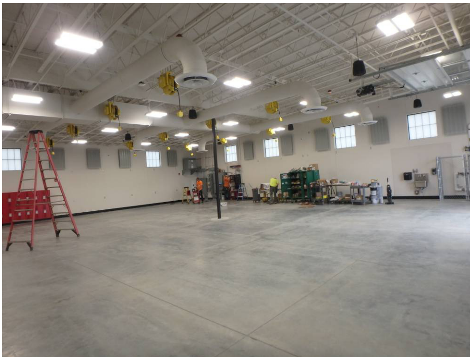
Looking northwest across the shop