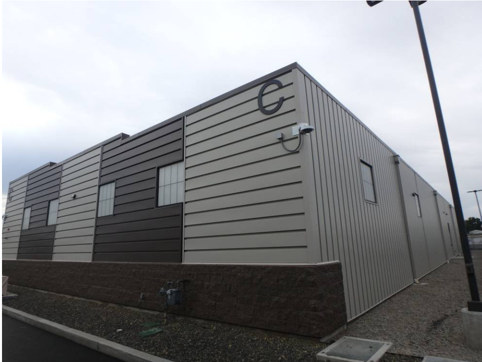
Looking at the northwest corner of the building