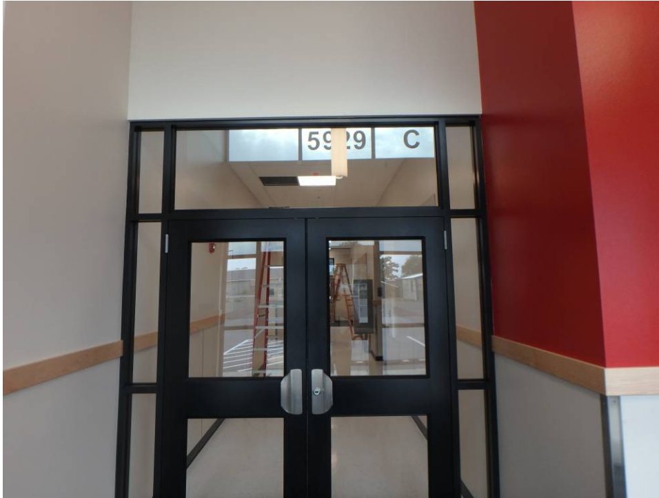
Looking west at the inner vestibule doors