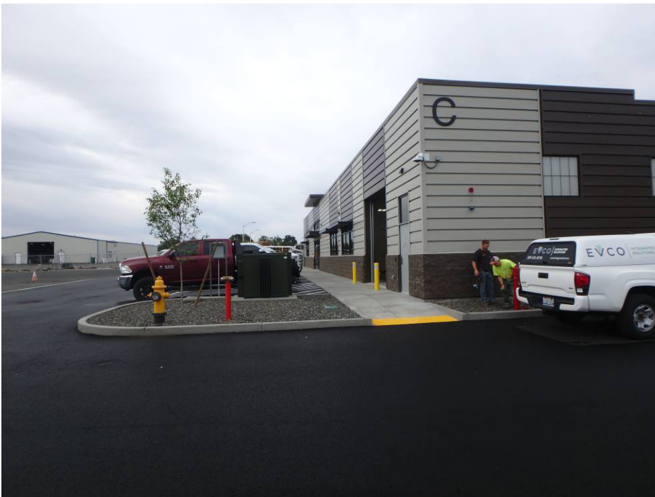
Looking at the northeast corner of the building