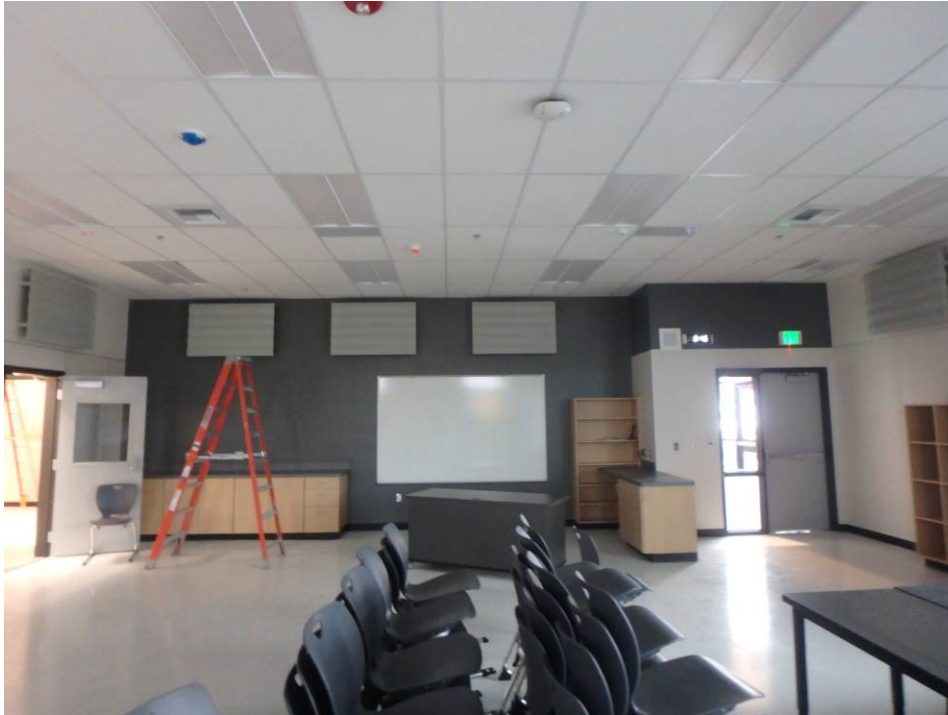
Looking at the north wall of the south classroom and NE entry