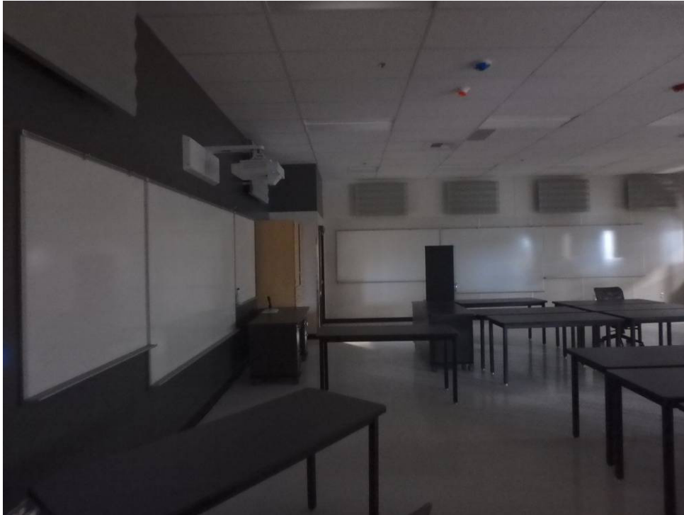
Looking west along the south wall of the north classroom