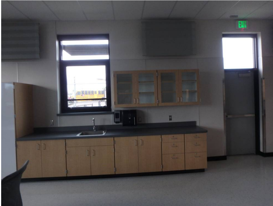
South classroom – south wall