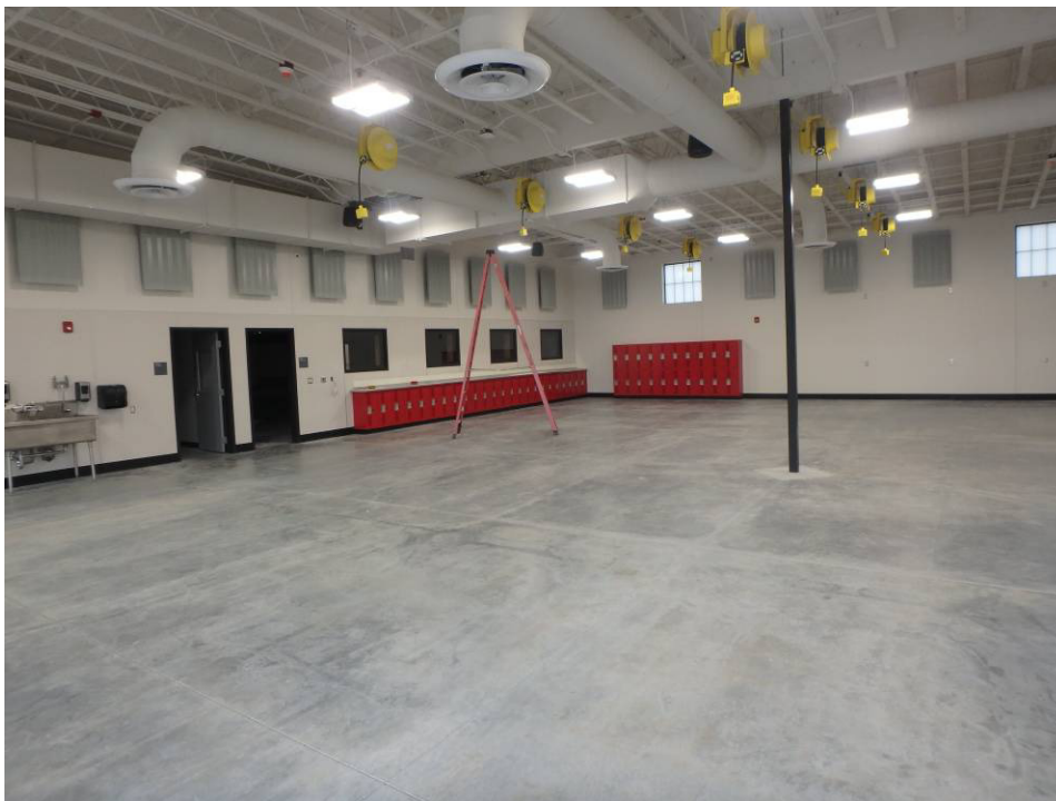
Looking southwest across the shop