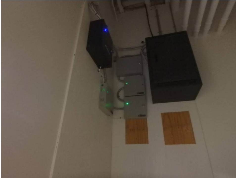
Storage room backboard and equipment, relocated lower panels to north wall - paint