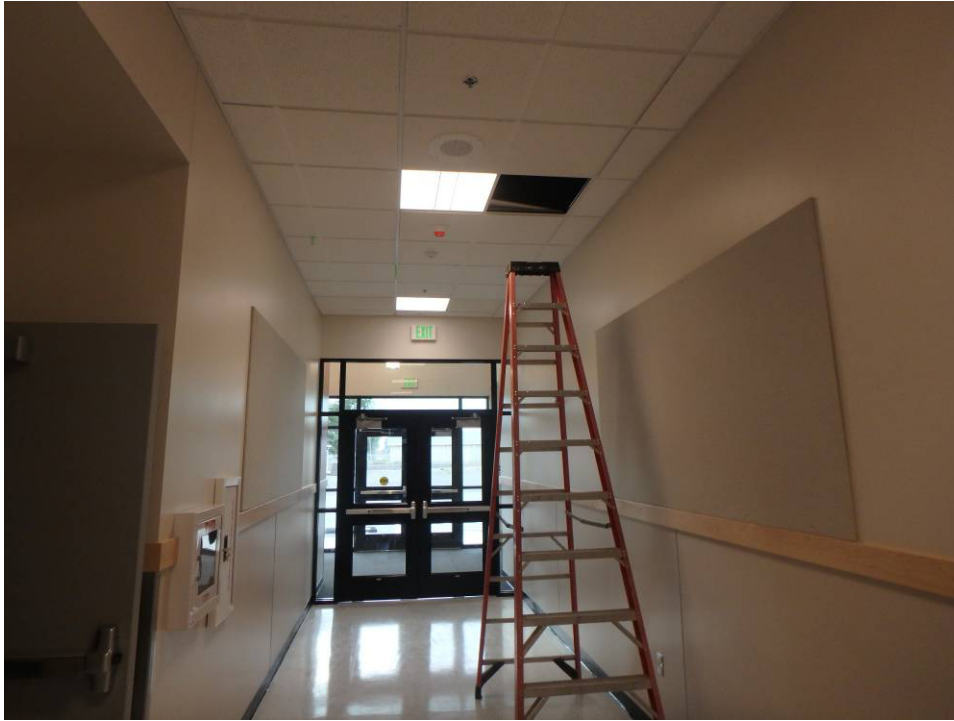
Looking east at the main east-west corridor