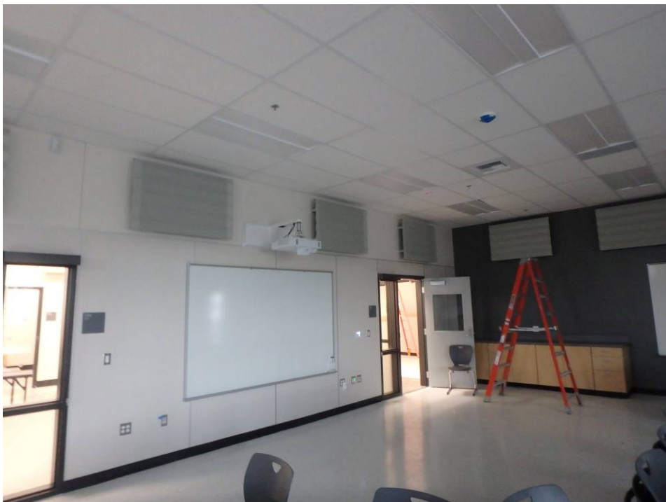
Looking at the acoustical wall panels on the west wall of the south classroom