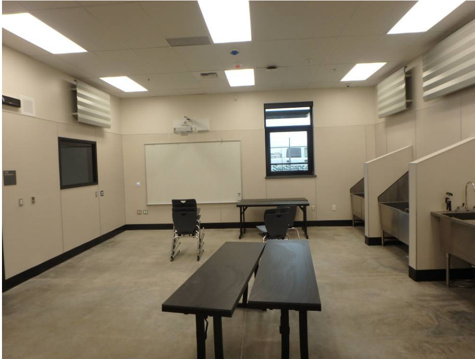
Lab south wall