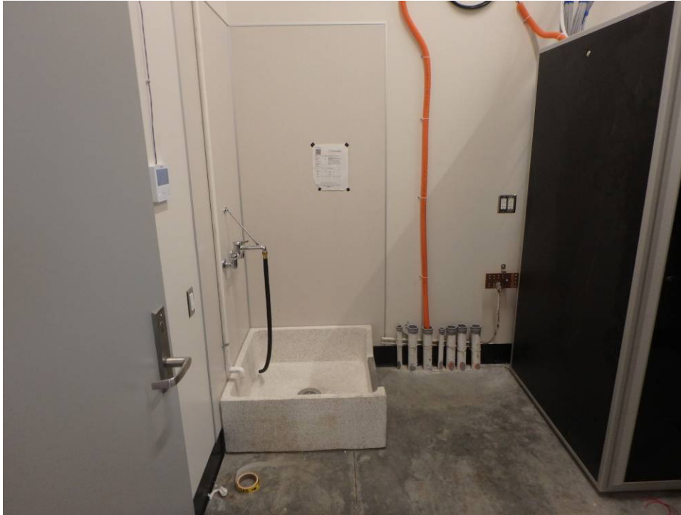
Mechanical room – janitor's sink