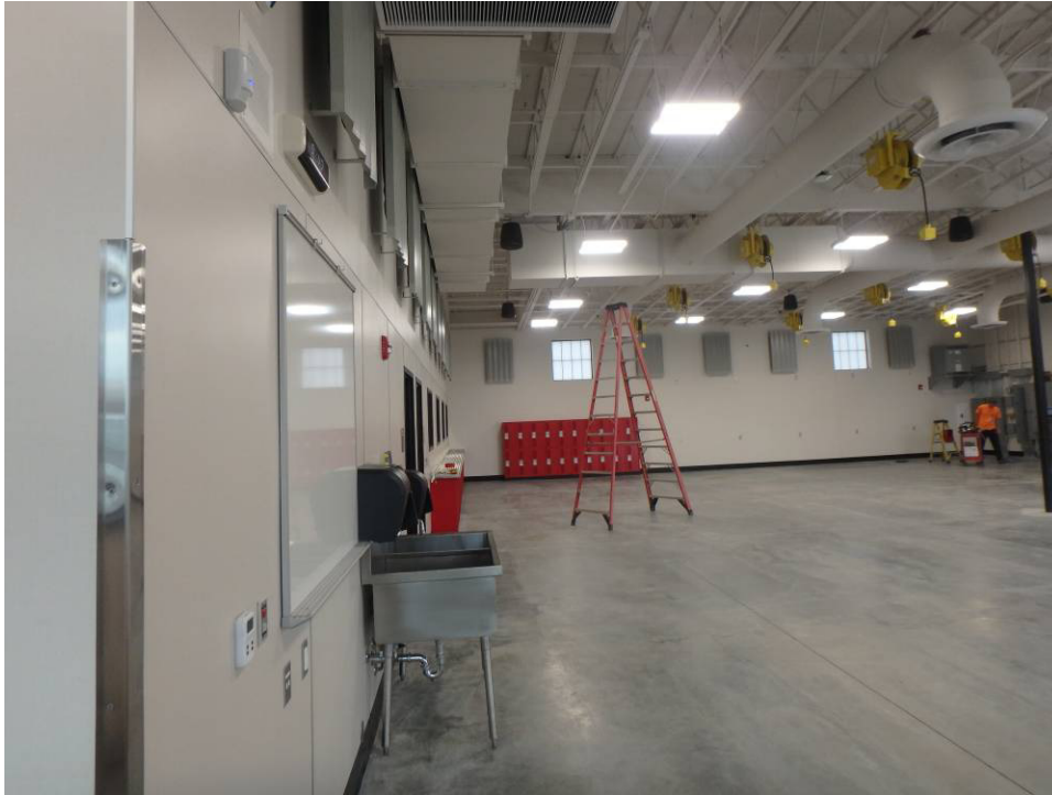
Looking west along the Shop's south wall