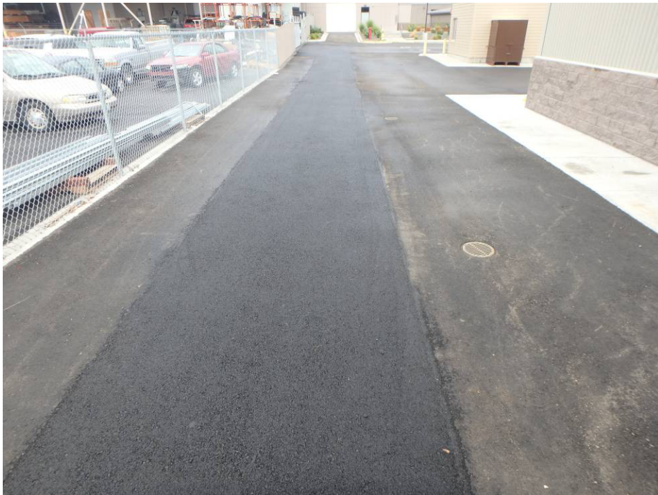
Looking west at the alleyway