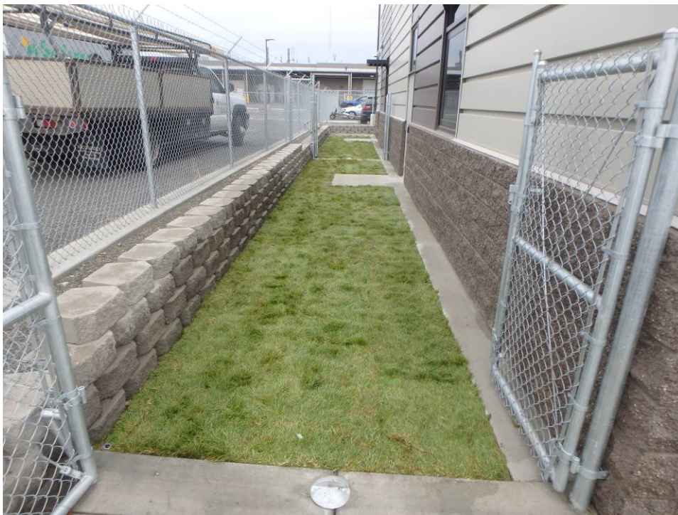
Looking west along the south elevation of the building and new sod