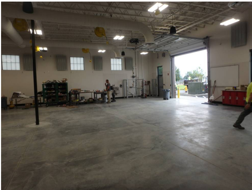
Looking northeast across the shop