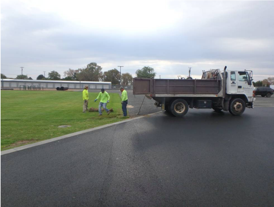
North site, sod patching