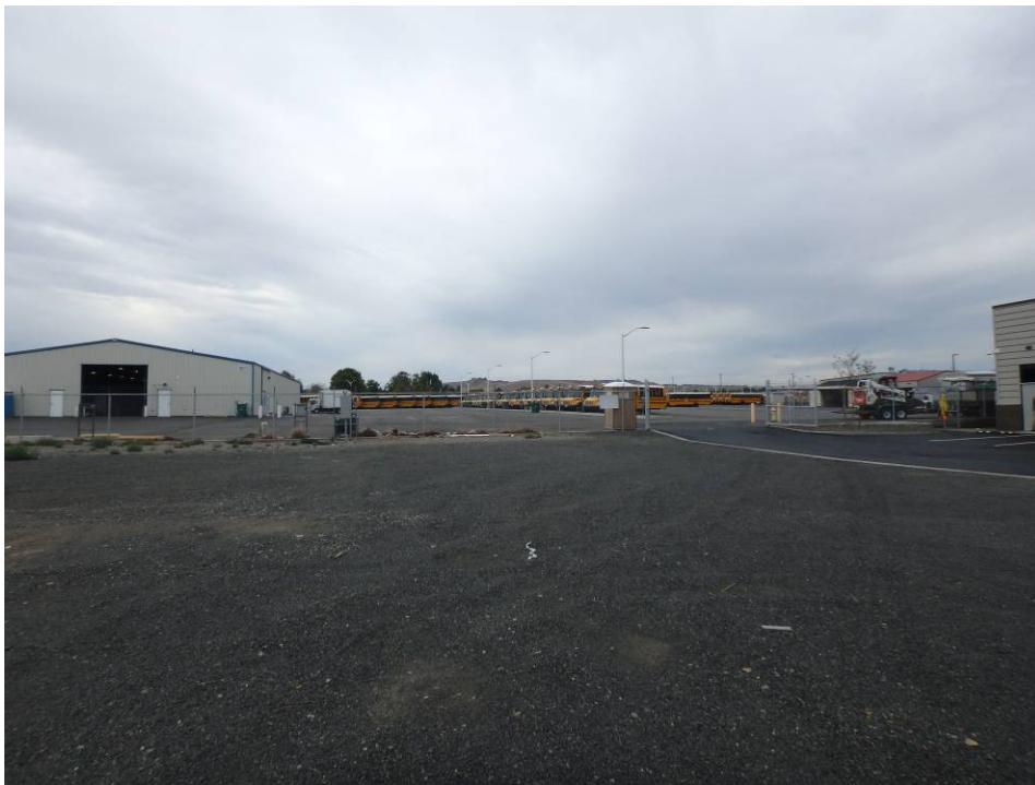
Looking south along the central curb at the main site entry