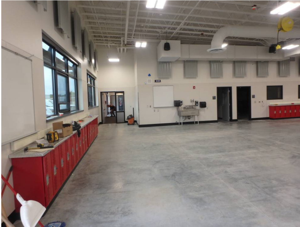
Looking south along the shop's east wall and lockers with diamond plate top