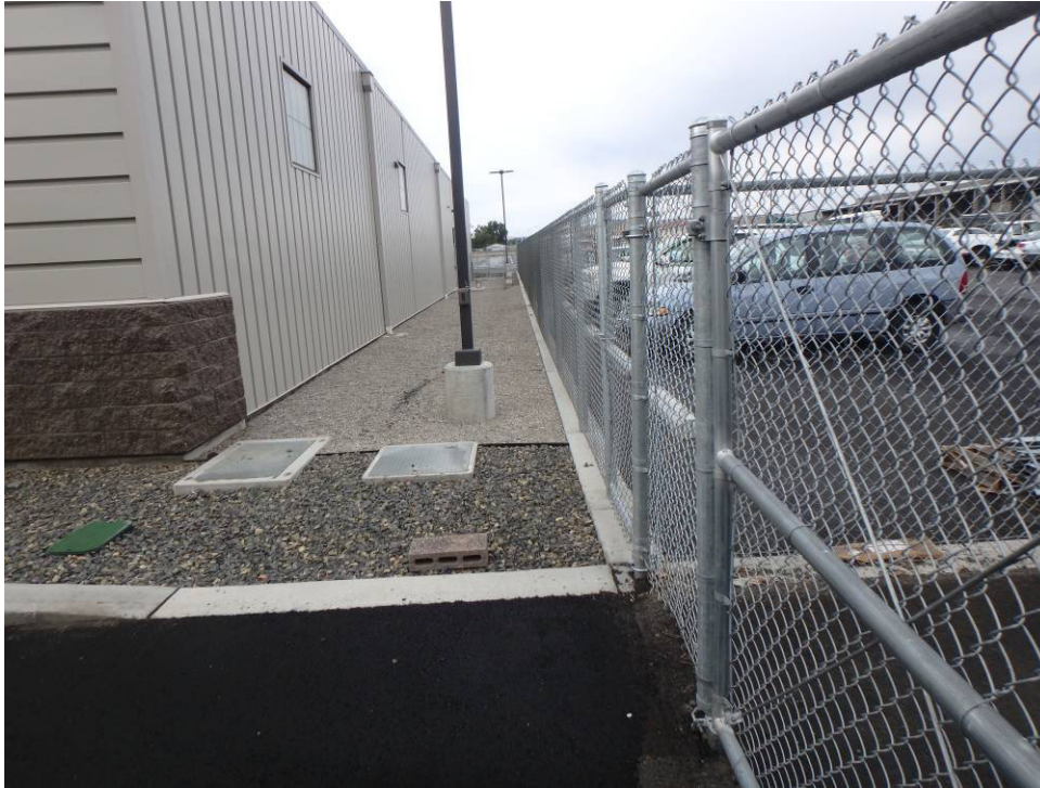
Looking south at the west (rear) elevation