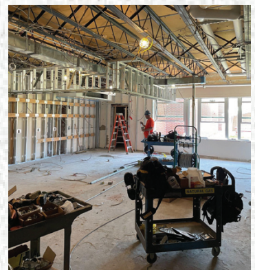
NEW Nurse's Office is coming together.