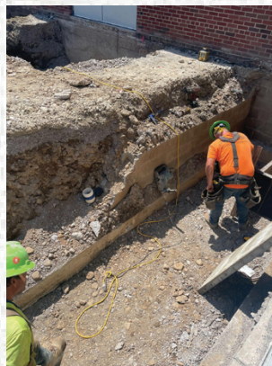
Excavation for the NEW STEAM addition