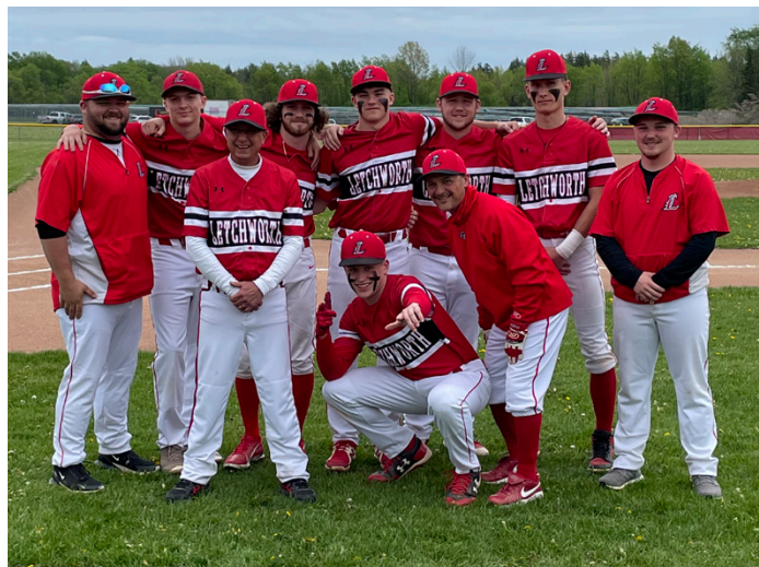
Letchworth Central School - 5550 School Road - Gainesville NY 14066 - 585-493-5999

Maintenance of Database: Copies of correspondence, related documents, investigative reports, and summary reports involved in the complaint will be maintained Letchworth Central School for five years. Records will be made available to interested parties in accordance with the provisions of the NYS Freedom of Information Law (Public Officers Law Sections 84-89).