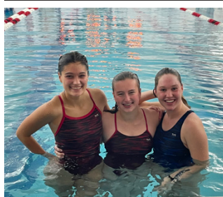
Our Senior swimmers.