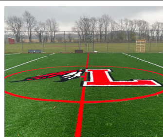
The artificial turf has been installed