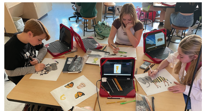
HS students creating during Studio Art.