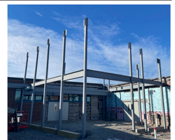
Steel is going up for the new Innovation Center