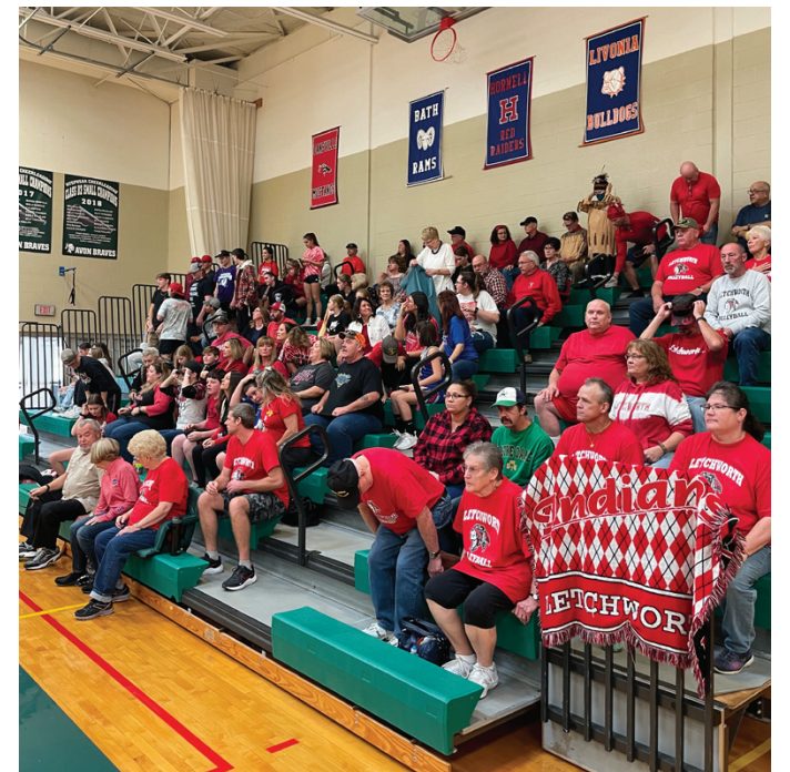
A fantastic show of support from our community at the Volleyball Sectional Finals.