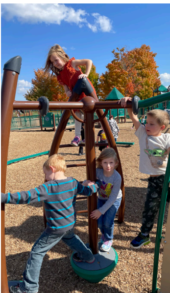
Elementary students enjoying the sunshine and new addition to the playground.