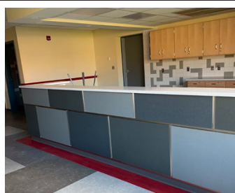
Renovations are complete in the new Nurse's suite.