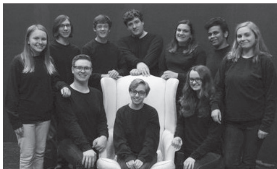
Midlakes Theatre Experience brings four shows to the Black Box Theatre from November 1-4.

Presale tickets for “Night Watch” are available at the Midlakes High School Office, Phelps Hometown Pharmacy, Peirce’s Gift Shop in Clifton Springs, Deb’s Crafts and Things in Newark, Stomping Grounds in Geneva and Renaissance — The Goodie II Shoppe in Canandaigua at the cost of $8 for