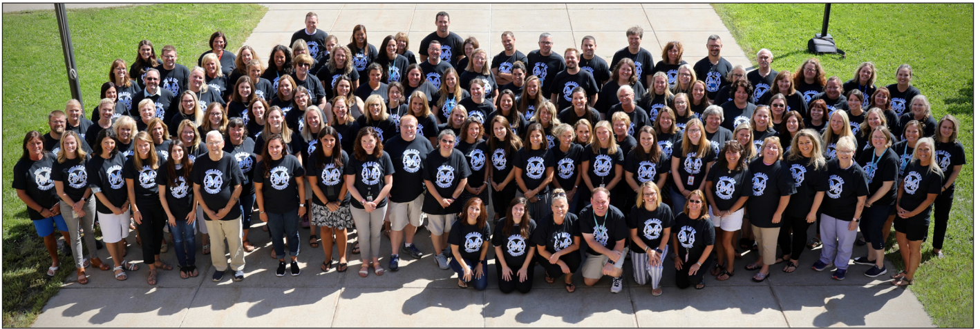
The staff of Midlakes Elementary School gathers in front of the school prior to the start of the new school year.