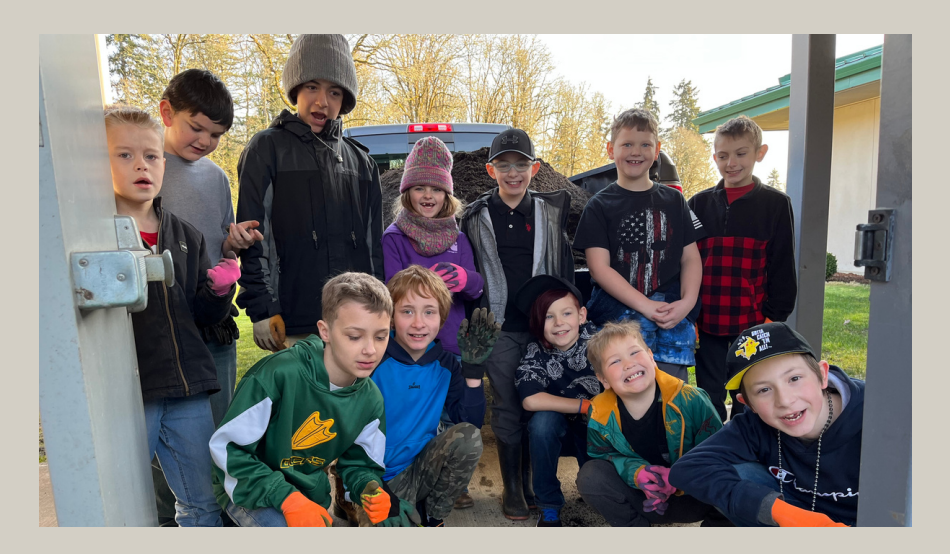
This project was a culmination of social skills, teamwork, sweat and good vibes!

Students unloaded over 3 yards of garden mulch and now have multiple starts in McBride's brand-new greenhouse!