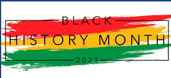
Black History Month