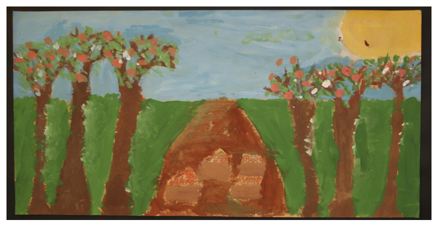
Artwork provided by Meadow Heights Students, "Art in Action" program.