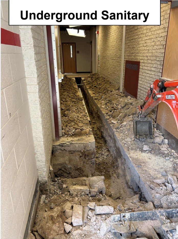
Cut for New Underground Sanitary