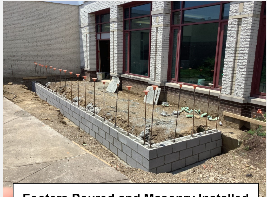
Footers Poured and Masonry Installed