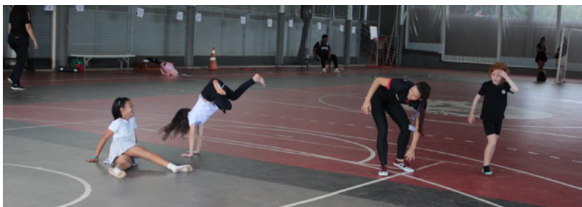
Pictures from our Club EAB & LS Athletics Open Demonstrations in May 2023!