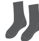
Navy socks non-patterned, opaque