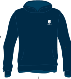
Hoodie/Grad Hoodie, crested