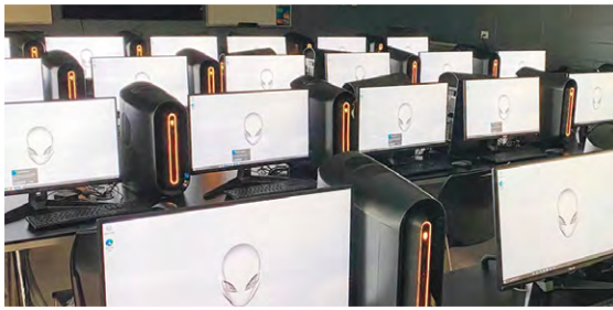
Esports gaming lab with Alienware software

Marian Catholic is on the cutting edge of technology and the leader amongst high schools in innovation and student accessibility. We offer a three-year engineering program that utilizes the Project Lead The Way curriculum. Our state of the art engineering lab features 3D printers, a Universal laser cutter, and a CNC machine for milling and carving wood. A student and faculty favorite is our soundproof studio with green screen capabilities, which is used for broadcasting the news, recording special segments, and producing creative classroom videos.