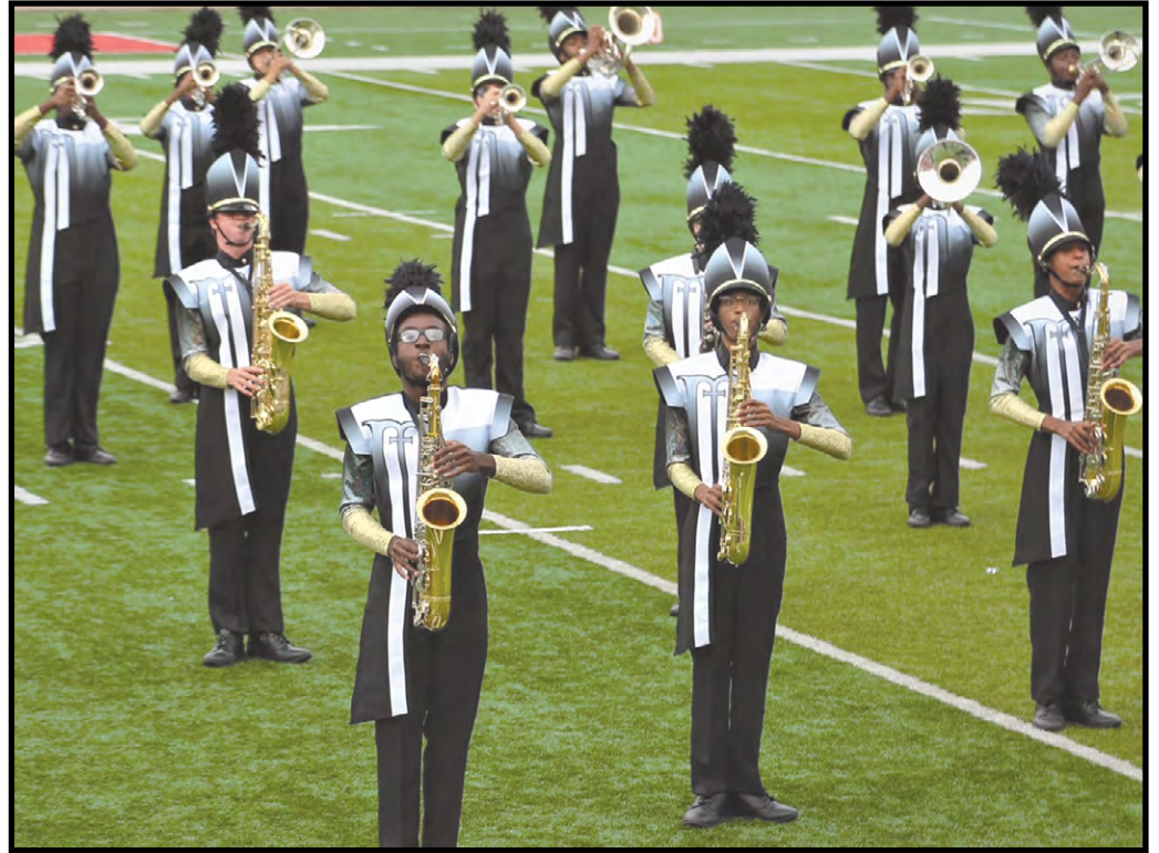
Marian Catholic's Marching Band is a seven-time Bands of America Grand National Champion

Being a member of the Marian Catholic Band means you'll be part of one of the most successful and highly decorated bands in the country. National and state championships will be your goal as you navigate your way through marching season, which culminates at the Bands of America Championships in Indianapolis.