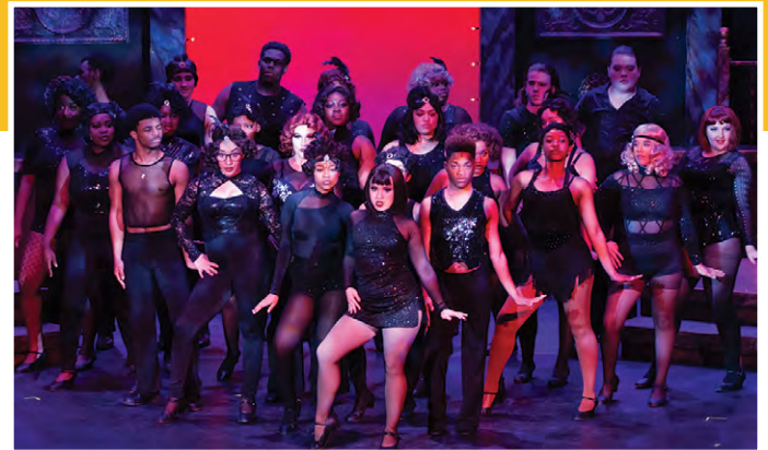
Cast of Chicago the Musical (Spring 2023)

Marian Catholic is on the cutting edge of technology and the leader amongst high schools in innovation and student accessibility. We offer a three-year engineering program that utilizes the Project Lead The Way curriculum. Our state of the art engineering lab features 3D printers, a Universal laser cutter, and a CNC machine for milling and carving wood. A student and faculty favorite is our soundproof studio with green screen capabilities, which is used for broadcasting the news, recording special segments, and producing creative classroom videos.