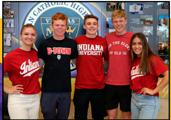
Indiana University is always a popular choice for our students who reside in Indiana.