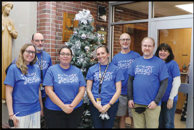
The math department shows off their Christmas spirit

It won't take long for you to discover Marian Catholic's faculty is a cut above the rest. While it's true that 81% of them hold advanced degrees and they know their subject matter inside and out, what really sets them apart is their unwavering passion and dedication to your success. There isn't a teacher in our school who wouldn't go the extra mile to make sure you are the best student you can be on a daily basis. Your successes are their successes, and that's what drives them day-in and day-out.