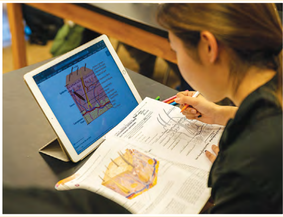
1:1 iPad program since 2014