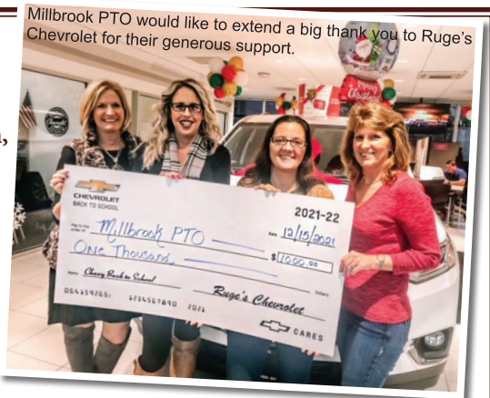
Millbrook PTO would like to extend a big thank you to Ruge's Chevrolet for their generous support.