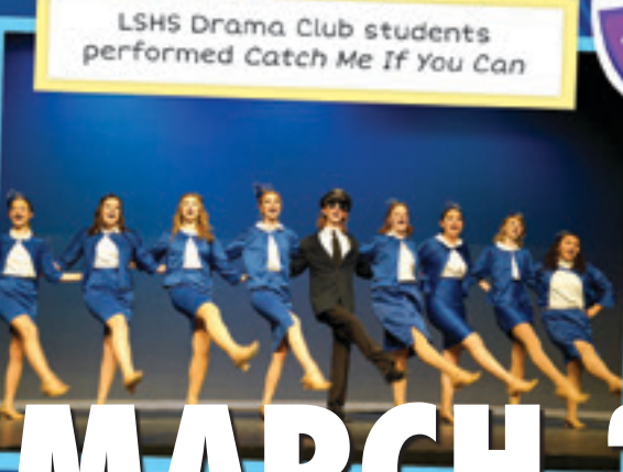
LSHS Drama Club students performed Catch Me If You Can