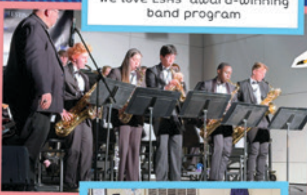
We love LSHS' award-winning band program