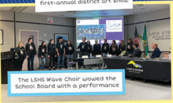
The LSHS Wave Choir wowed the School Board with a performance