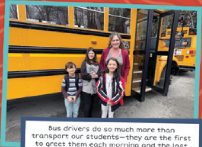
Bus drivers do so much more than transport our students—they are the first to greet them each morning and the last to wish them well each afternoon