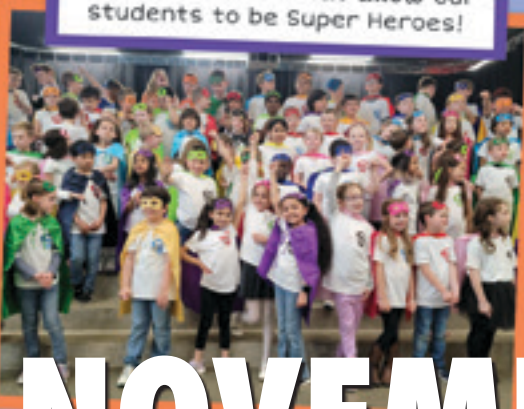
School concerts that allow our students to be Super Heroes!