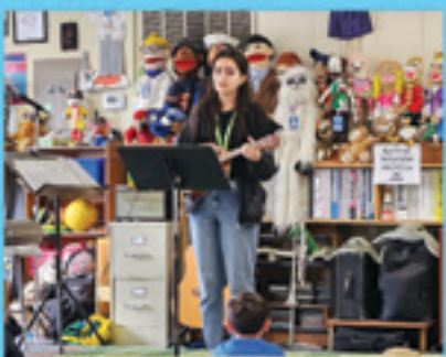
A Careers in Education student teaches during a music class at Skyline