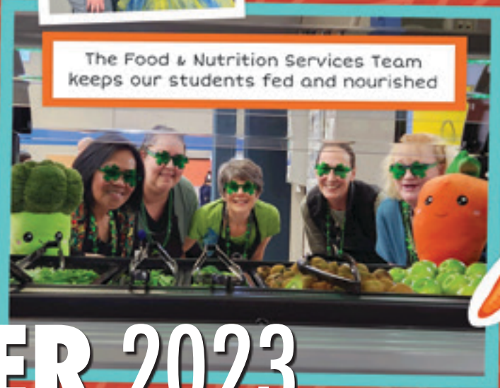
The Food & Nutrition Services Team keeps our students fed and nourished

"I have the privilege of working for a principal I really admire and respect."