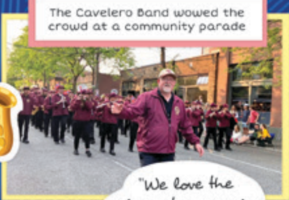
The Cavelero Band wowed the crowd at a community parade