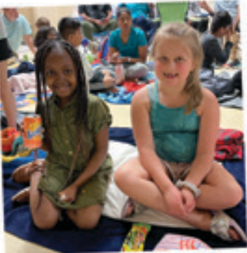
"Family Movie Night at Sunnycrest!"