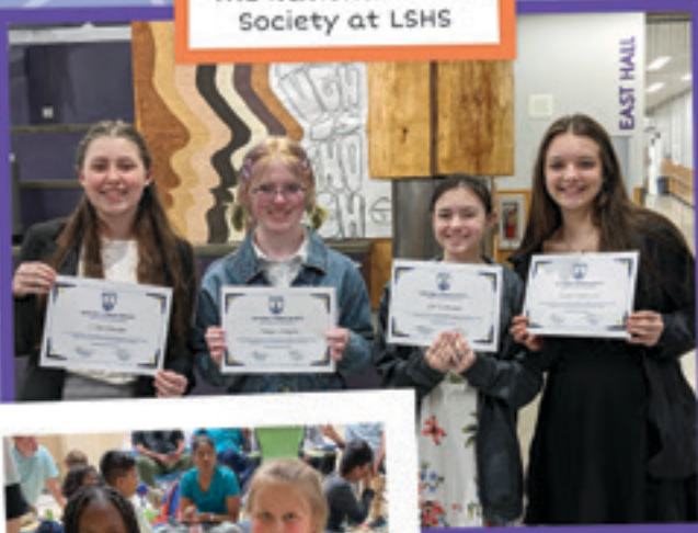
The National Honor Society at LSHS