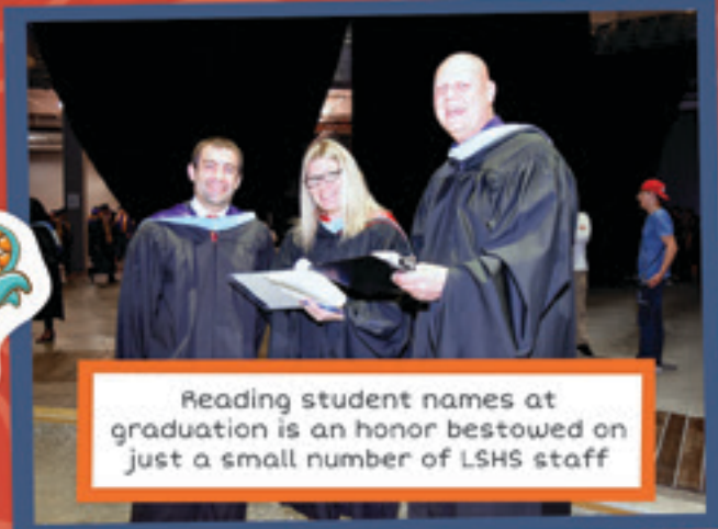
Reading student names at graduation is an honor bestowed on just a small number of LSHS staff