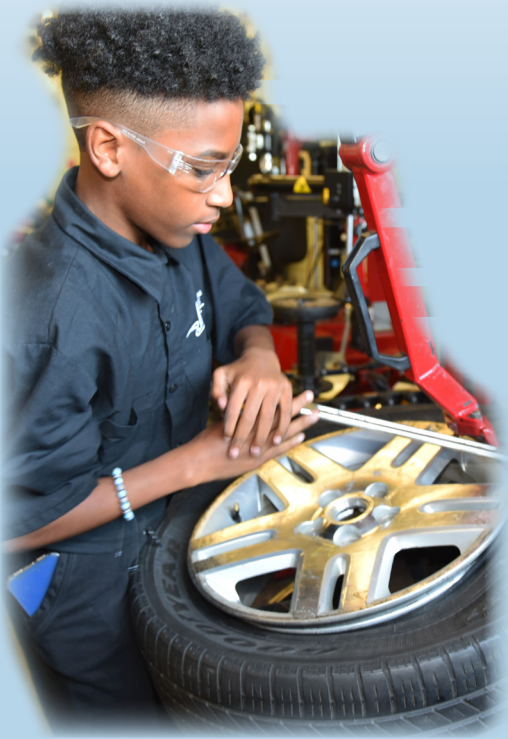
Educational Services That Transform Lives

Eastern Suffolk BOCES, an inclusive educational cooperative of 51 Long Island school districts, provides regional leadership and advocacy, direct instruction, management, and support through quality, cost-effective instructional programs, and shared services. These programs and services maximize inclusive educational and career opportunities and equitable access for Long Island’s diverse community promoting lifelong learning for both children and adults, to achieve excellence and enhance the operational effectiveness of the region.