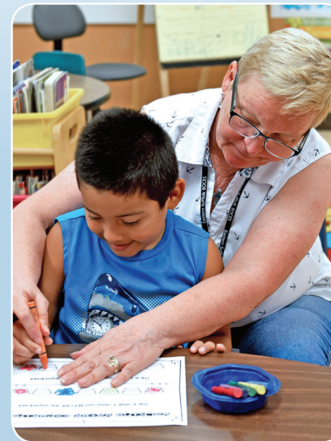
Educational Services That Transform Lives