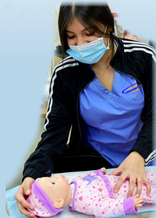
Educational Services That Transform Lives