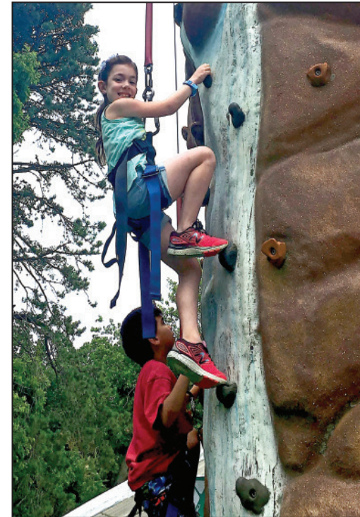
Educational Services That Transform Lives