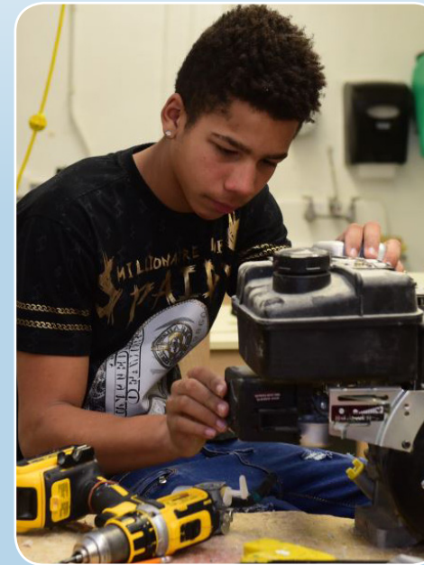
Educational Services That Transform Lives