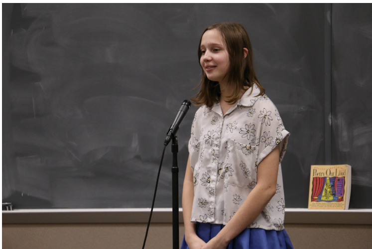
Left: Jasper High School Students participated in a Poetry Out Loud reading.