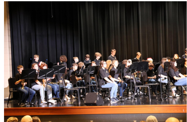
Above: The Jasper Middle School Band performed at the Christmas Concert.