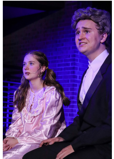
Above: Jasper High School Performing Arts put on a production of 'White Christmas'.