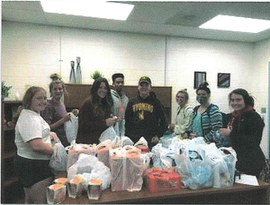
Student volunteers help with bagging!

This year, we have been able to distribute take-home food bags to middle and high school students on Fridays. This program, started in Spring 2021, is funded through community donations. We are thankful to be able to provide this resource to our students!