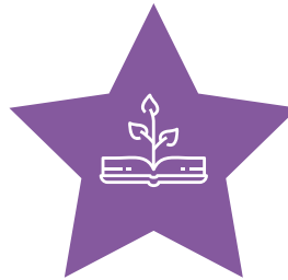
Nurtured, Engaged & Empowered Students