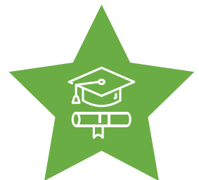
Academically-prepared Critical Thinkers