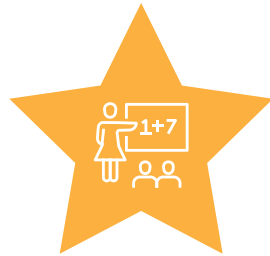
Success in the Early Years

With equity in mind, the strategic plan's five measurable goals span preschool to high school: