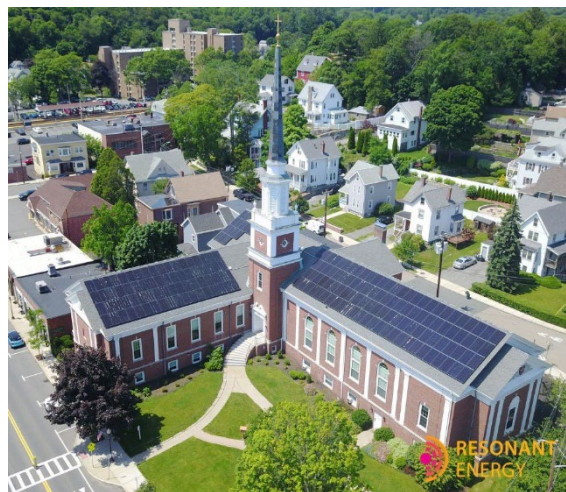
A solar PV system installed at the Melrose Highlands Church.

Projects are encouraged to evaluate the feasibility of on-site renewable energy systems such as solar photovoltaic (PV) systems to be installed at the time of construction. Solar PV may be installed on flat roofs, pitched roofs, or on parking canopies. Solar PV generates electricity which can be used on-site to cover a portion or all of the on-site energy usage. Excess electricity may be sold back to the electricity grid for credits.