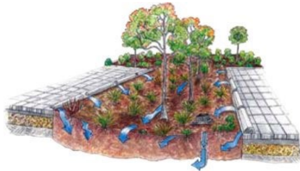
Diagram from Center for Urban Waters

Bioswales help channel and convey stormwater from a street, parking lot, or walkway and can absorb low flows or carry runoff from heavy rains to storm sewer inlets or rain garden. Bioswales improve water quality by infiltrating the first flush of storm water runoff and filtering the large storm flows they convey. When not raining, a bioswale may look like a stream bed.