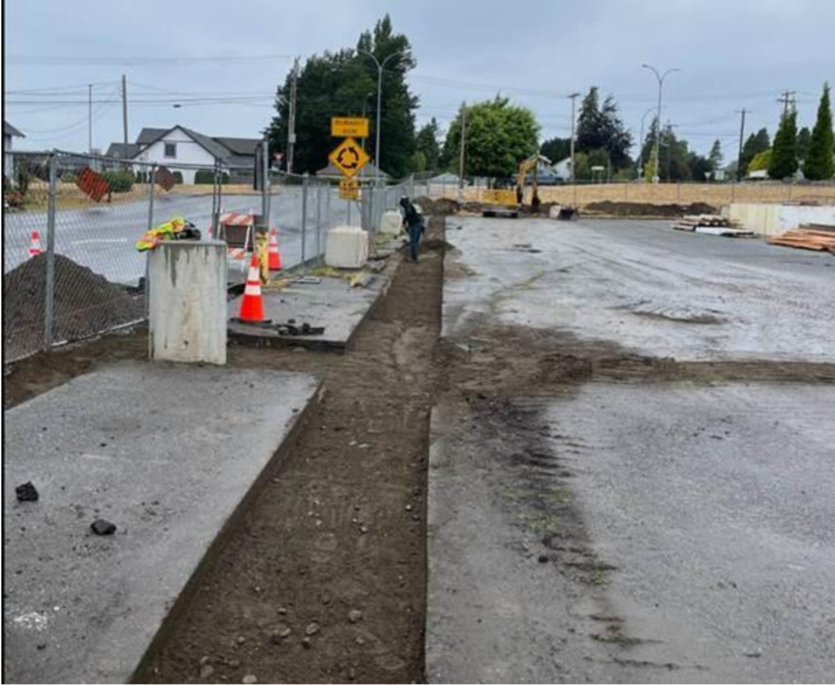
New light poles being installed around the parking area.