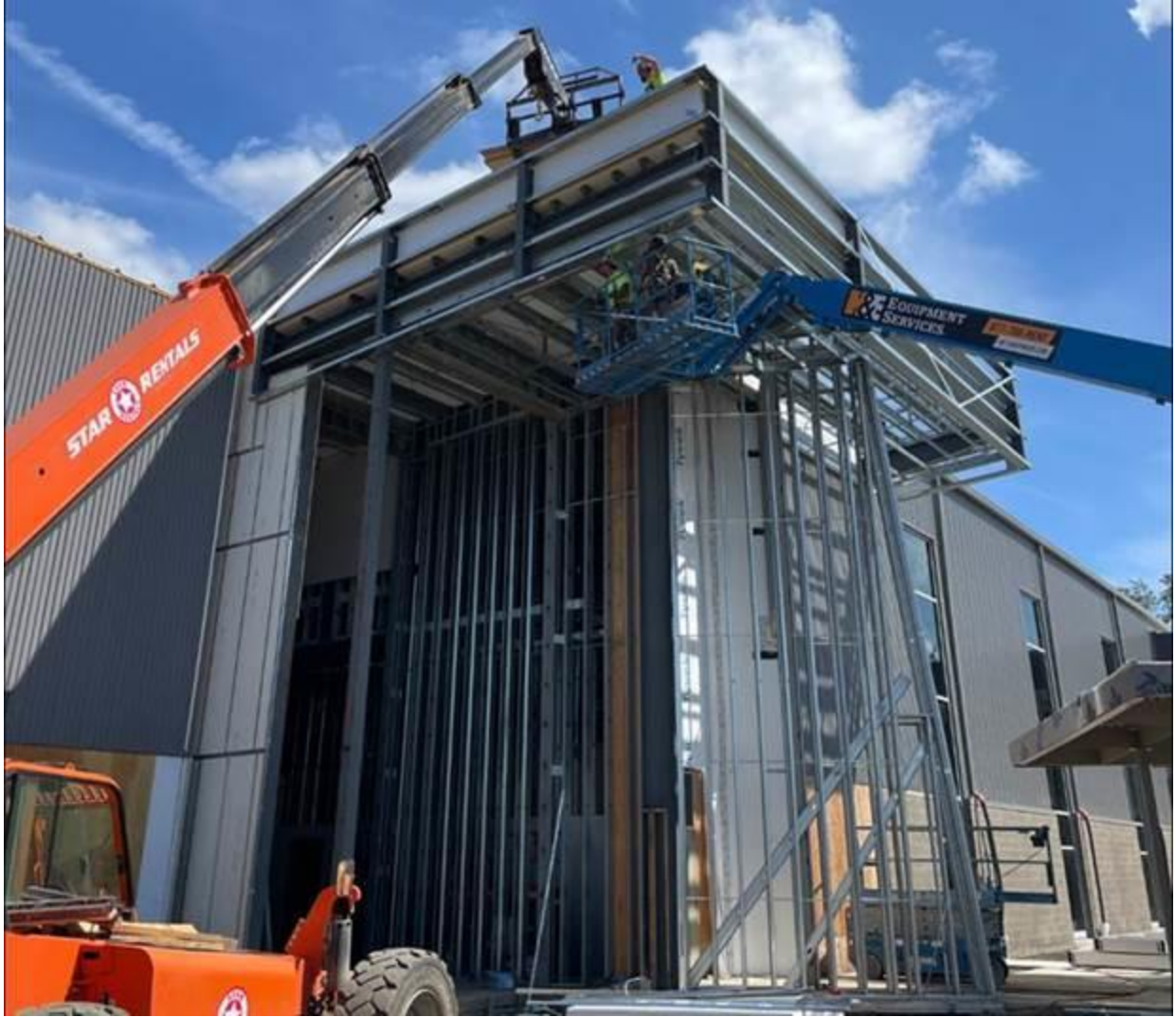
Progress continuing on the entry way to the Athletic Wing.