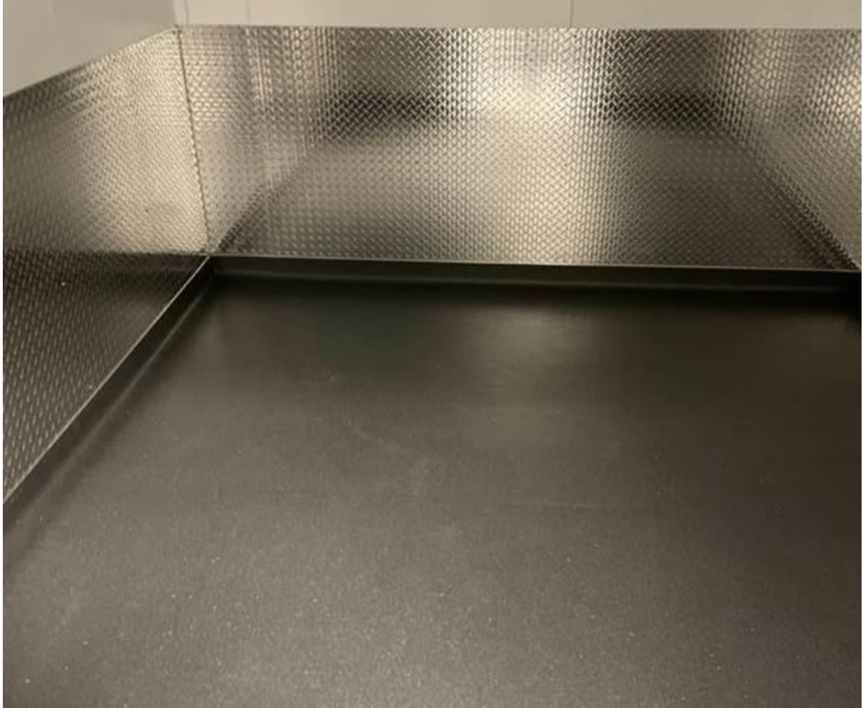
Finished flooring the in the main kitchen walk in coolers has been installed over the summer months.