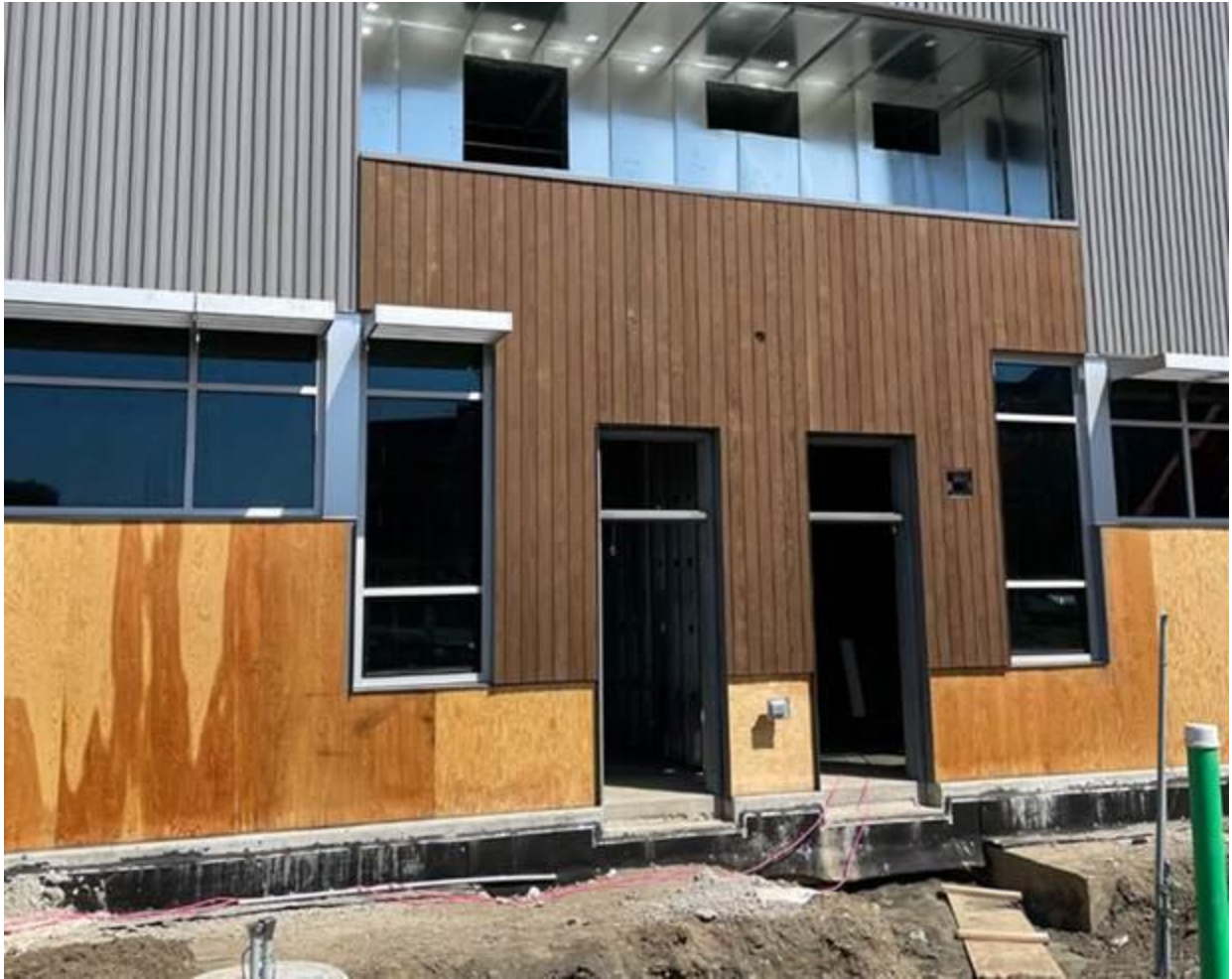
The final siding on the CTE Wing is complete and the area is now ready for the masonry block to be installed.