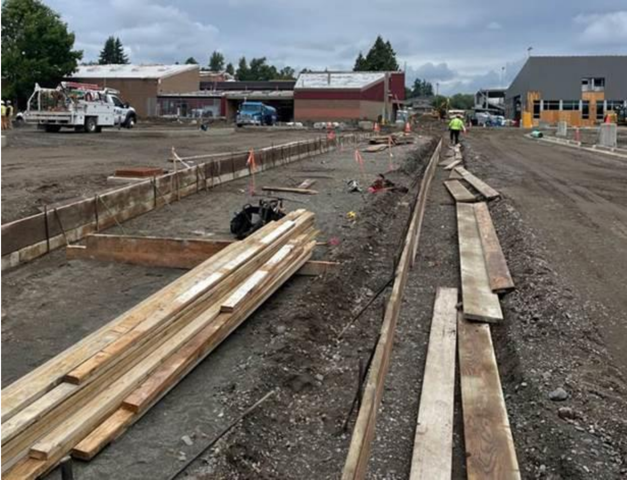
Curbs continue in the new parking area in preparation for asphalt being laid in August.