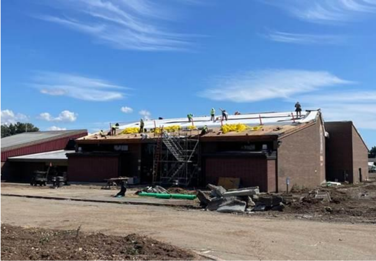
Roofing being installed on the Performing Arts Center.