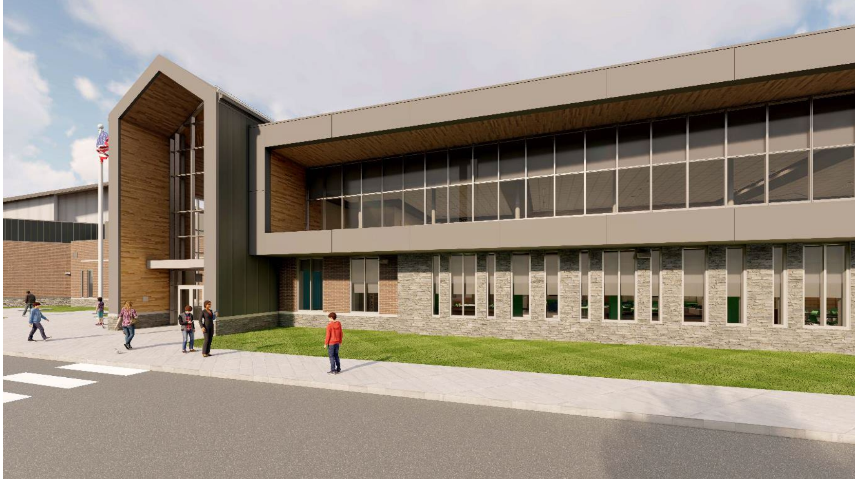
Front Entry/Media Center Rendering