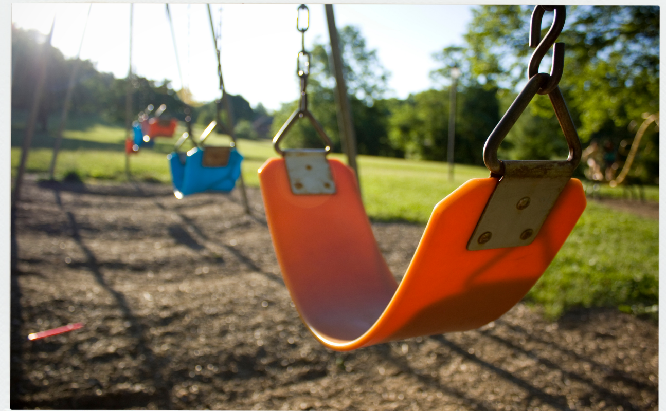
Games and Play

Five pieces of outdoor fitness equipment spaced around the walking trail.