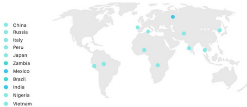
Countries Represented at Unisus School