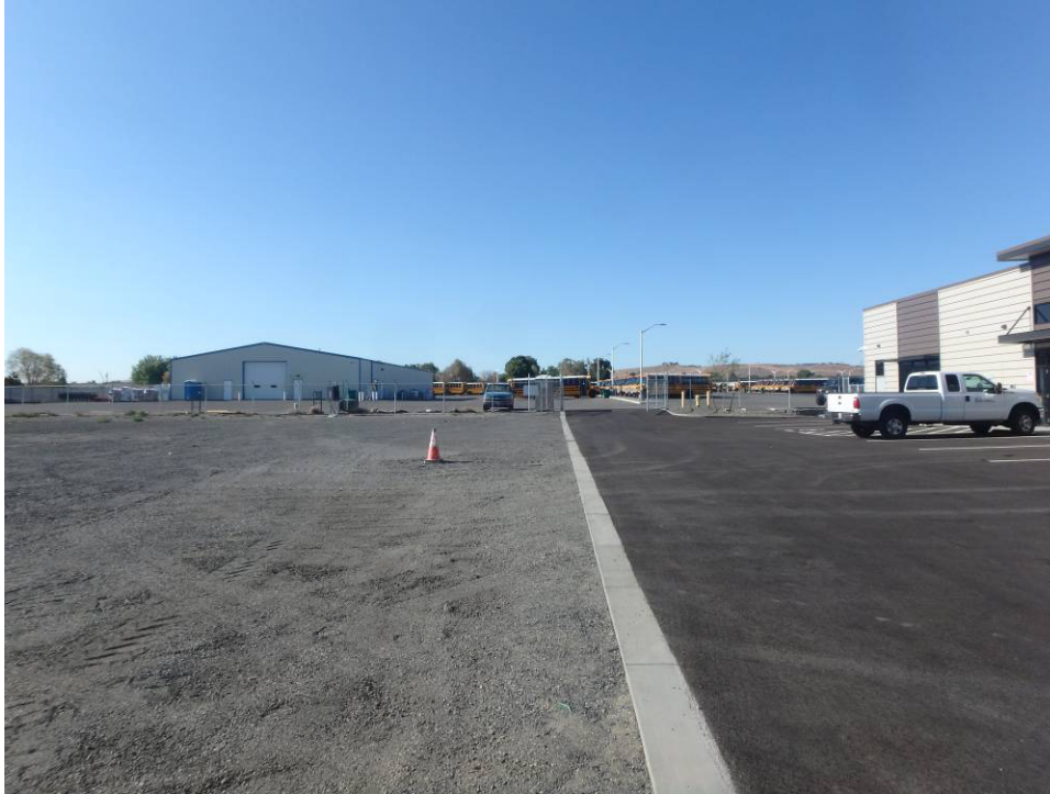
Looking north along the central curb