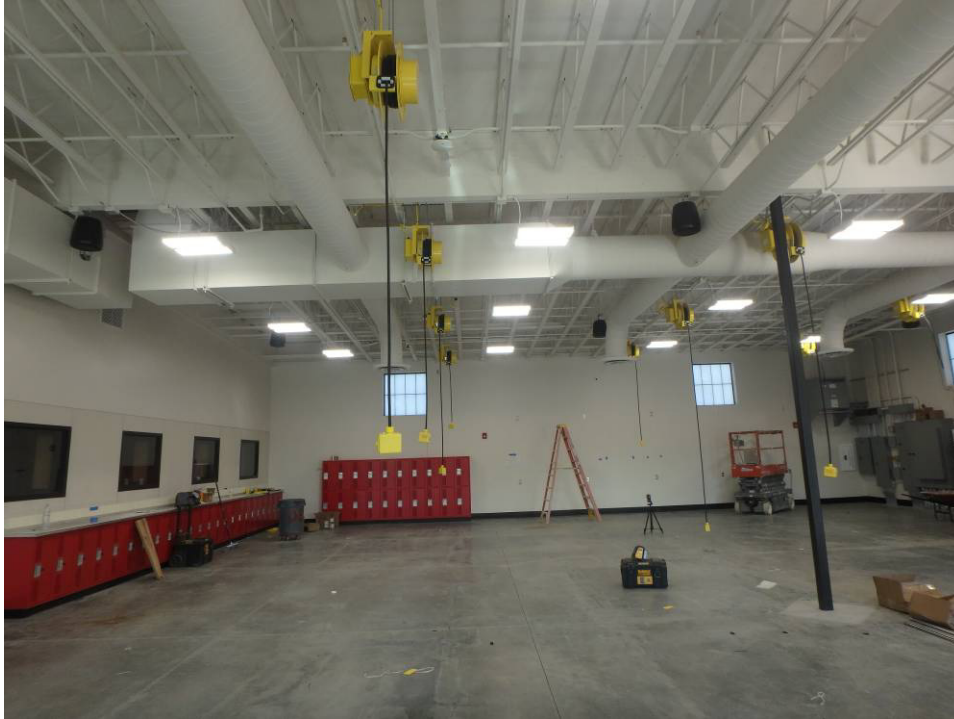
Wiring cord reels in the shop- south half