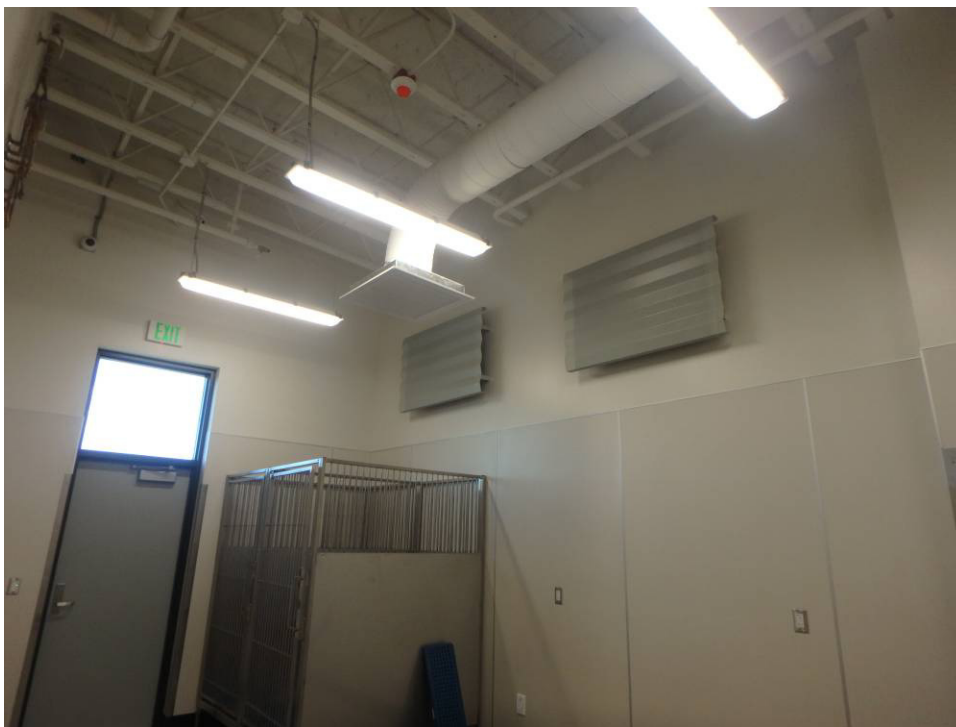
Kennel acoustical wall panels