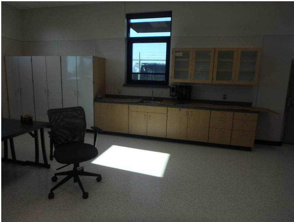
Looking south casework of the south classroom