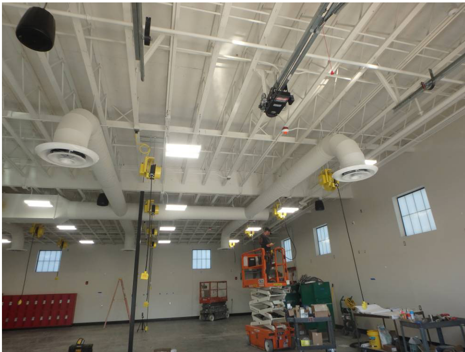
Wiring cord reels in the shop- north half