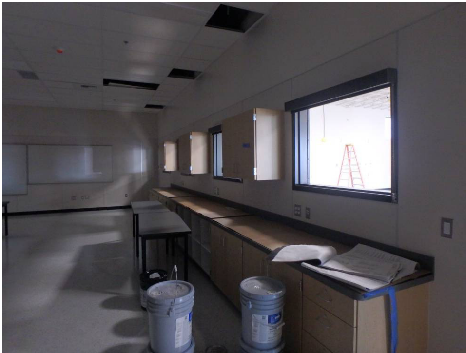
Looking west along the north classroom's north wall