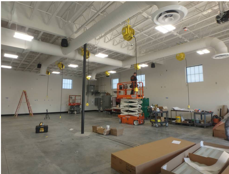
Looking northwest towards the shop's electrical panels and transformer mounted on the wall