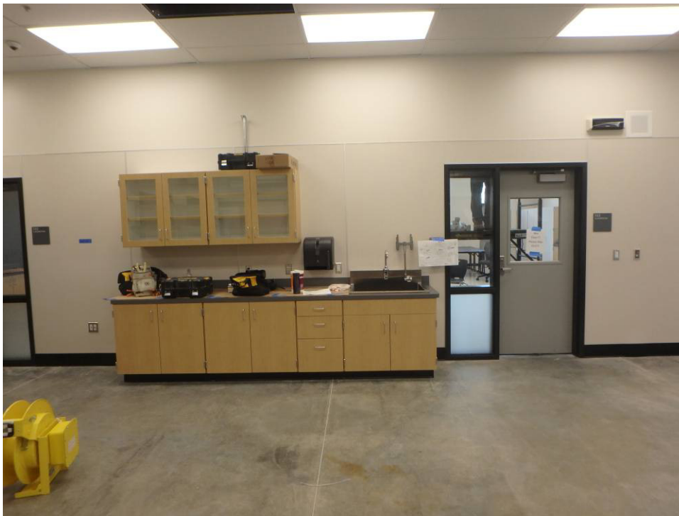
Lab – eyewash station and east wall