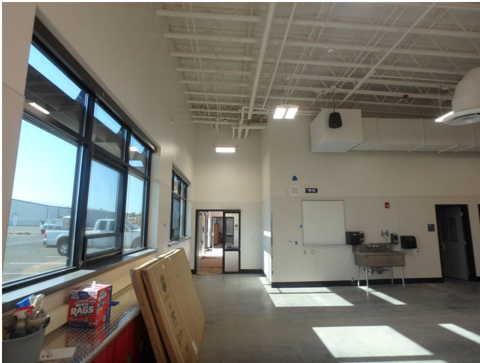
Looking south along the shop's east wall and lockers with diamond plate top