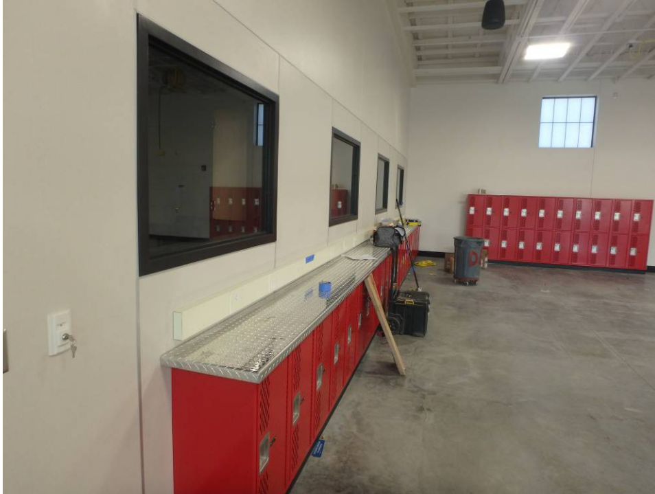
Looking west along the Shop's south wall