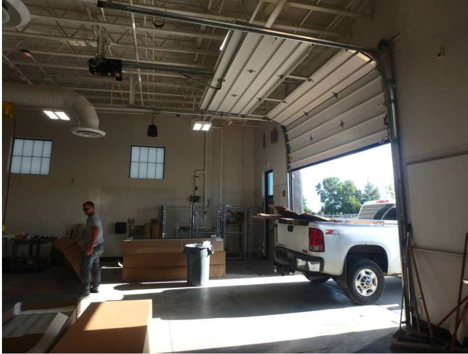
Looking north at the northeast overhead door