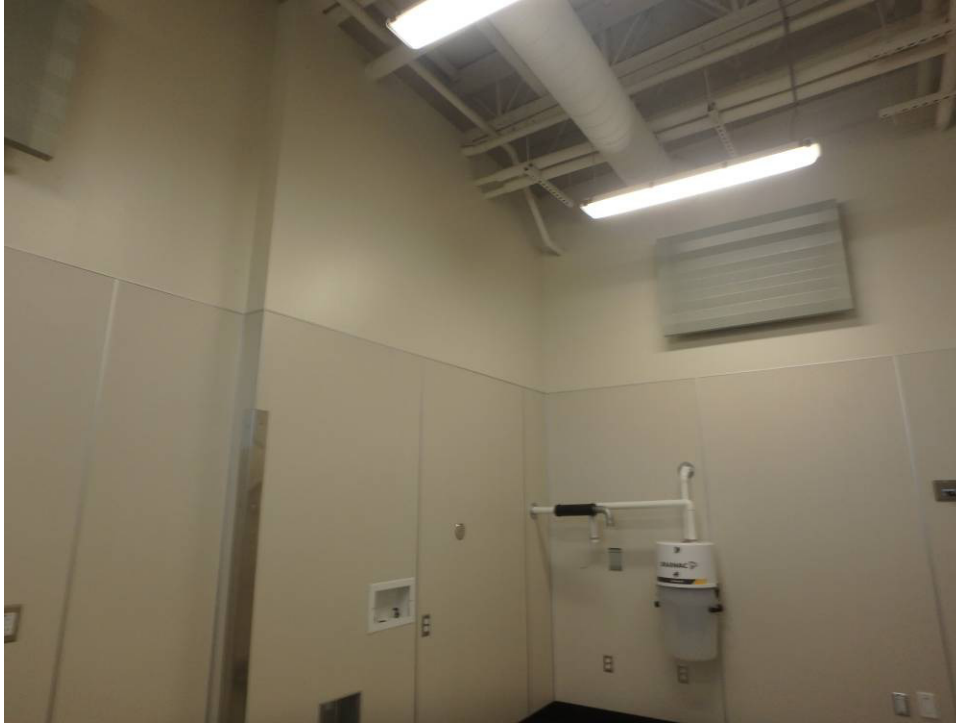
Kennel Room acoustical wall panels, vacuum and janitor sink on the north wall