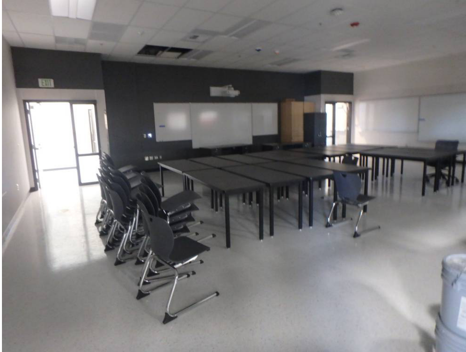
Looking southwest across the north classroom