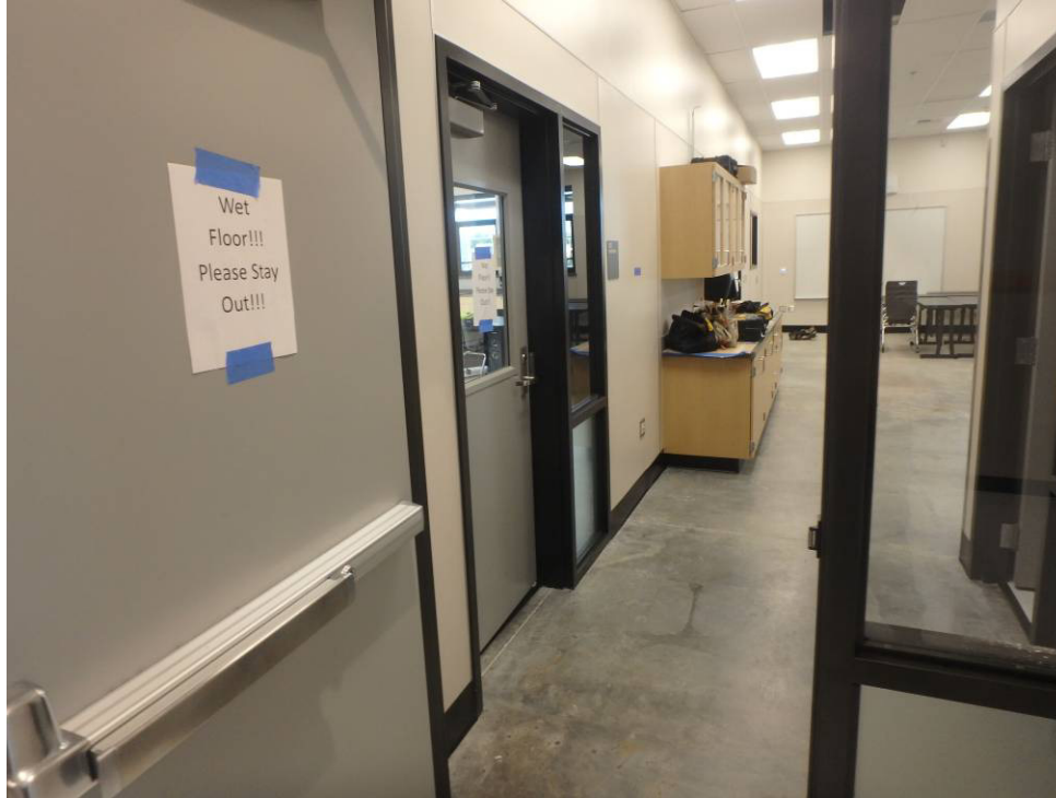
Lab – looking south into the lab from the north lab door