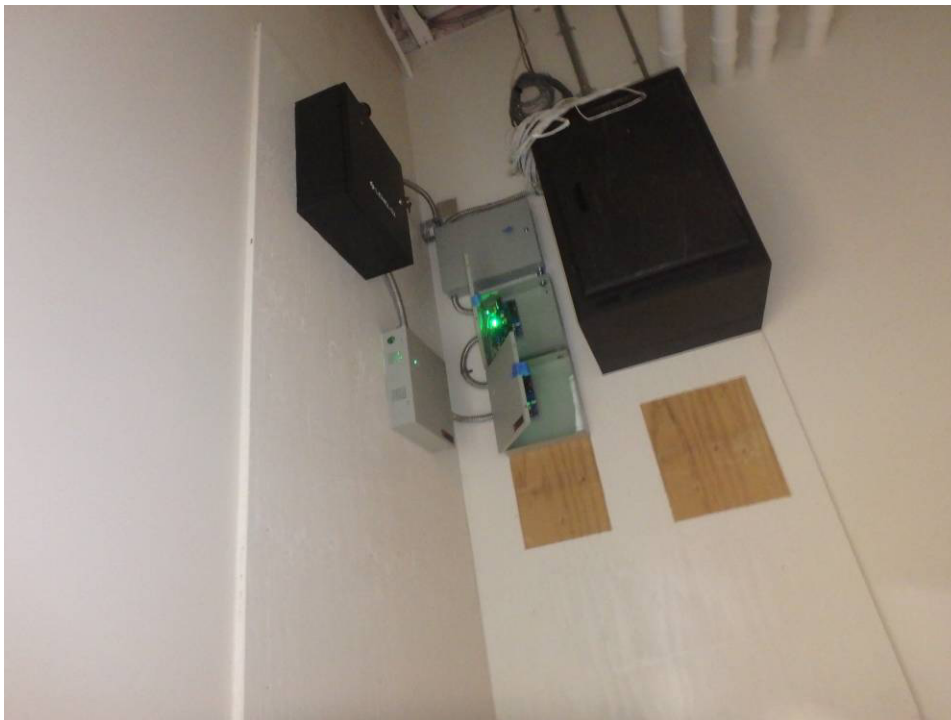
Storage room backboard and equipment, relocated lower panels to north wall - paint