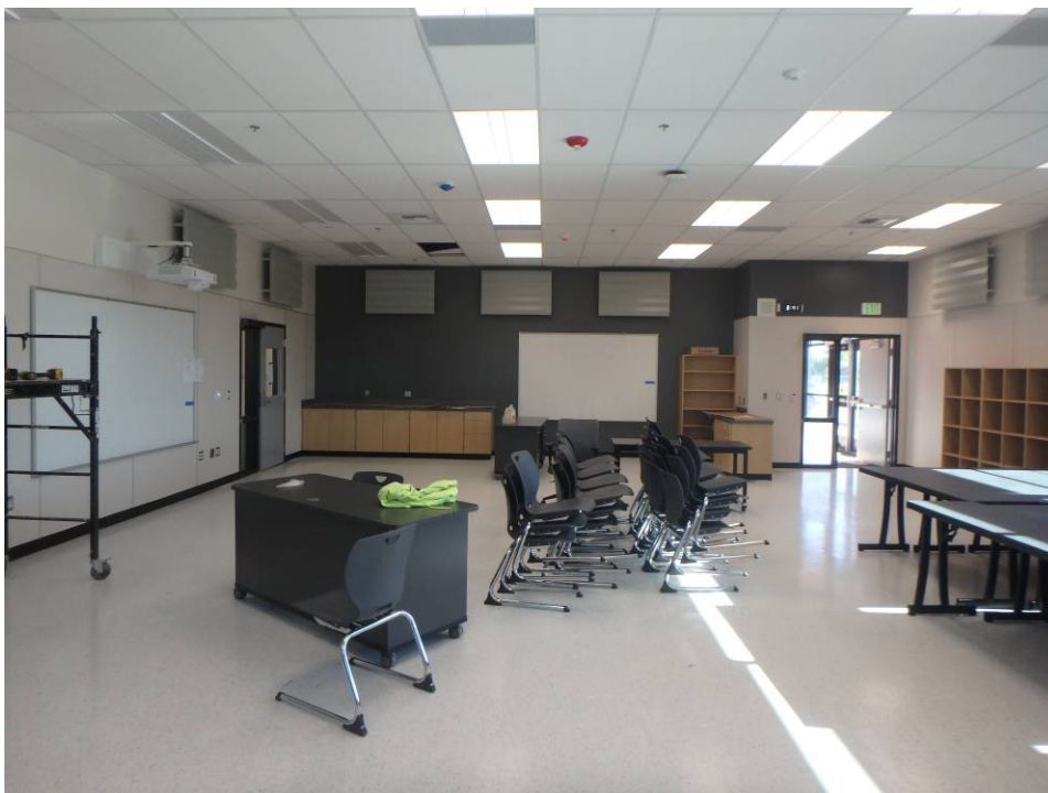
Looking north across the south classroom at the acoustical wall panels