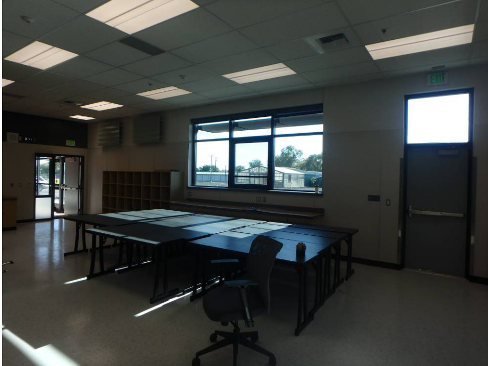
Looking east at the casework and acoustical wall panels on the east wall of the south classroom