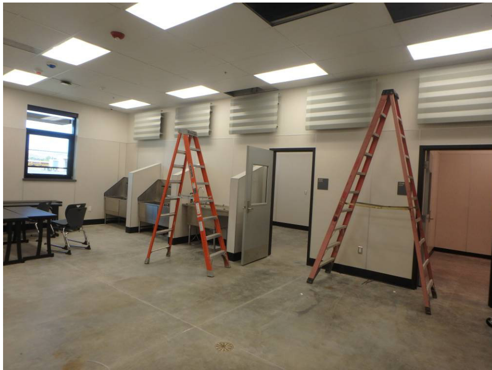
Lab – looking southwest at the new acoustical wall panels