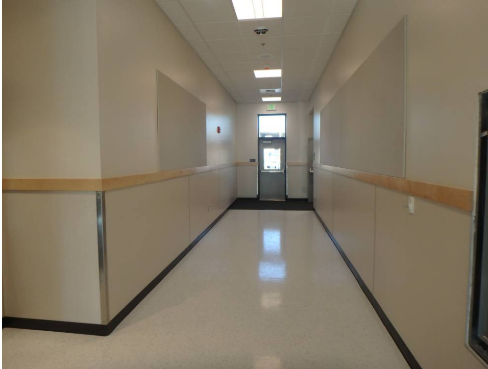
Looking west at the main east-west corridor