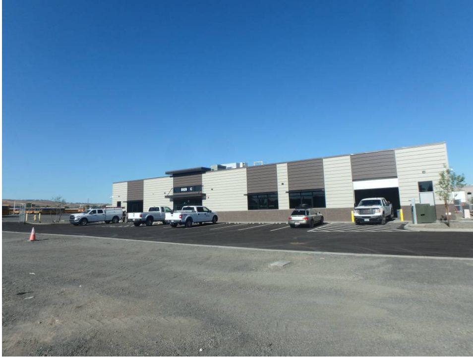
Looking southwest at the East Elevation