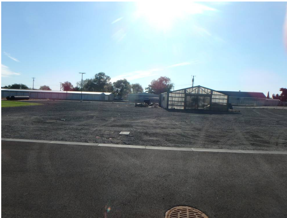
Looking east at the east half of the property