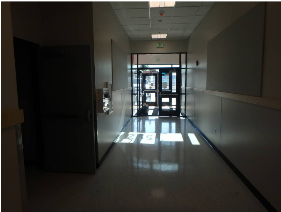
Looking east at the main east-west corridor