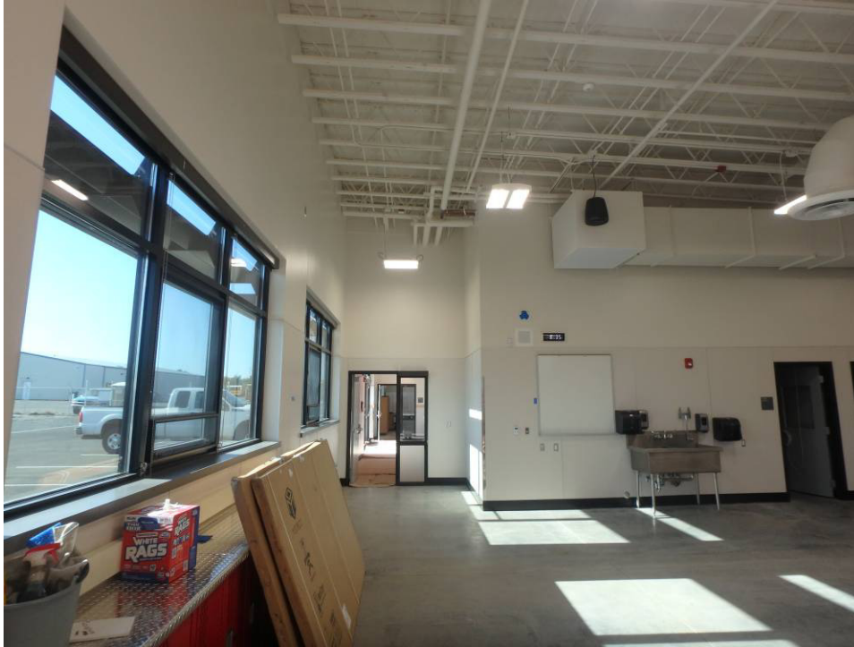
Looking south at the shop's entry door