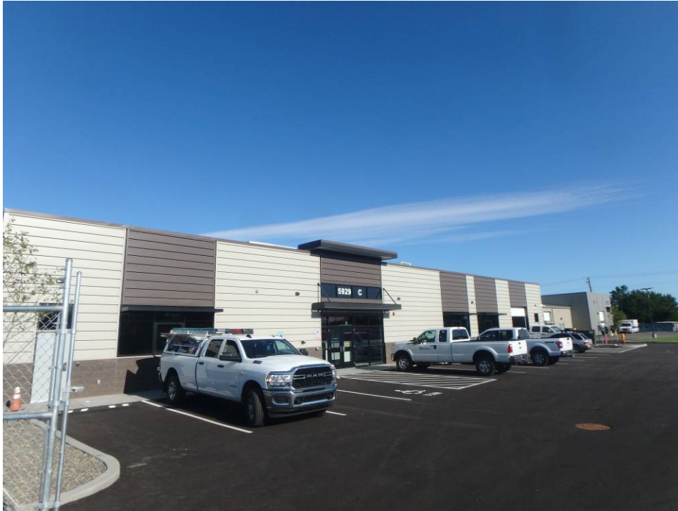
Looking north at the East Elevation