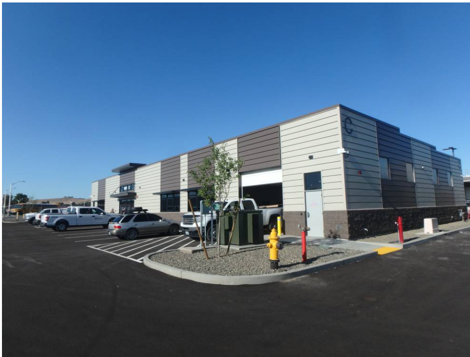
Looking at the northwest corner of the building