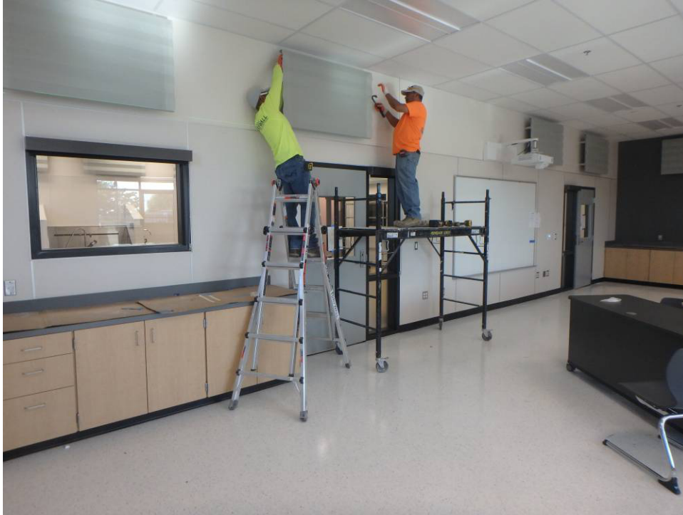
Looking at the acoustical wall panels on the west wall of the south classroom