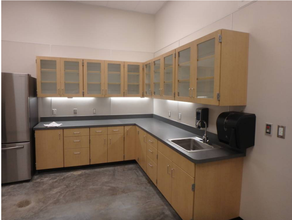
Exam room casework