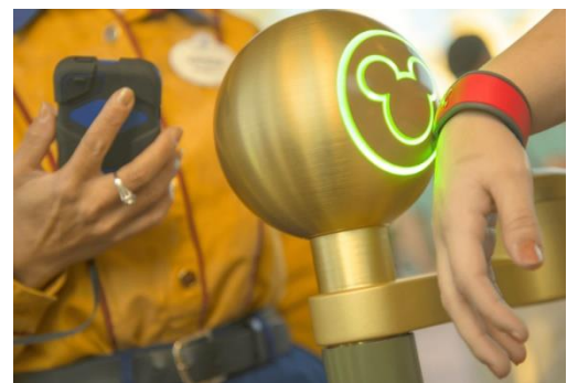
Disney World RFID/NFC MagicBand being read on their proprietary reader

A great example of this type of RFID technology is Disney World. In 2013 Disney World converted from paper tickets to using MagicBands, which are passive RFID plastic bracelets. These bracelets are used as your Park ticket, for FastPass, PhotoPass, purchasing food at their restaurants or merchandise in the stores. They are even used as your Disney Resort key to open your hotel room door if you're staying at one of their hotels. The bracelet must be presented to a RFID/NFC reader in order to read the UID in the bracelet that is associated to a person's account.